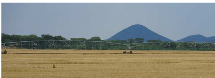
Amatheon Agri (Zambia) Limited Farms

The European Union through the EU-ACP Energy Facility funded the grid extension project under the Rural Electricity Infrastructure and Small Scale Projects in Mumbwa town, Central Province. Provision of electricity services has resulted in increased agricultural production especially for big farms (ZNS Kalenda, Kitumba Prison & Amatheon Agri) which has also trickled down to the local peasant farmer. 'Currently we are producing 30,000 x 50kg bags of maize as opposed to 7,000 bags before. All year round production is assured because we have electricity to power our water pumps and also use centre-pivots for irrigation.' Capt. Mwewa – Irrigation Engineer, ZNS Kalenda Farms.