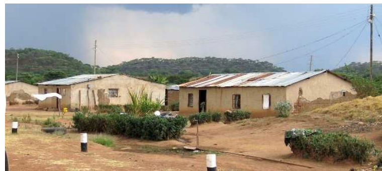
ZNS Kalenda Farms, Electrified Staff Houses