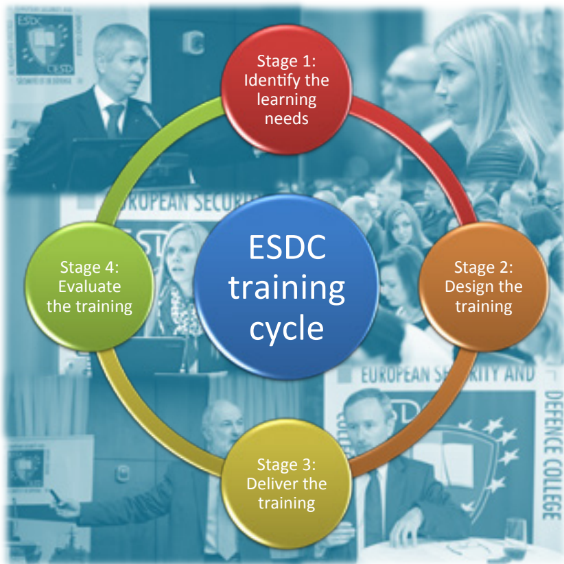
Graphic: Jochen Rehr

6. The ESDC evaluates all training events and includes its findings in the annual revision process. This ensures that shortfalls can be limited, good practices can be shared and a high quality of training can be guaranteed for future training activities.