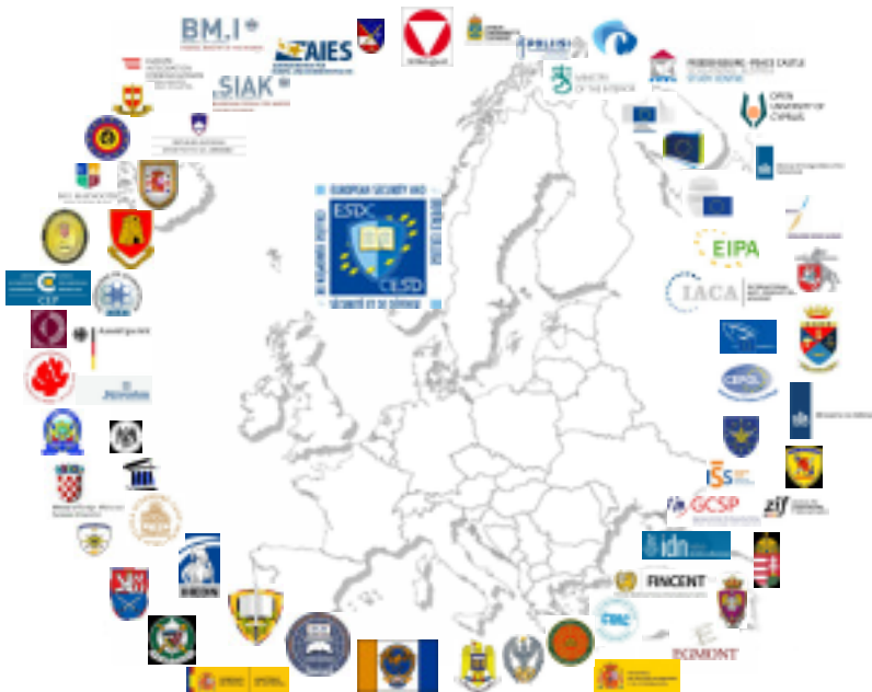
Graphic: Jochen Rehl

(including military academies within the military Erasmus programme) with various areas of expertise and backgrounds. Network members range from national defence academies to peace universities, from police colleges to diplomatic training institutes. Some of the college’s activities are hosted by ministries or permanent representations, others by EU institutions or other EU entities including the European External Action Service.