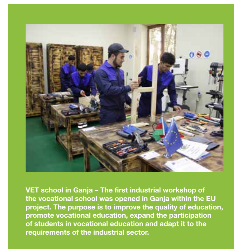
VET school in Ganja – The first industrial workshop of the vocational school was opened in Ganja within the EU project. The purpose is to improve the quality of education, promote vocational education, expand the participation of students in vocational education and adapt it to the requirements of the industrial sector.