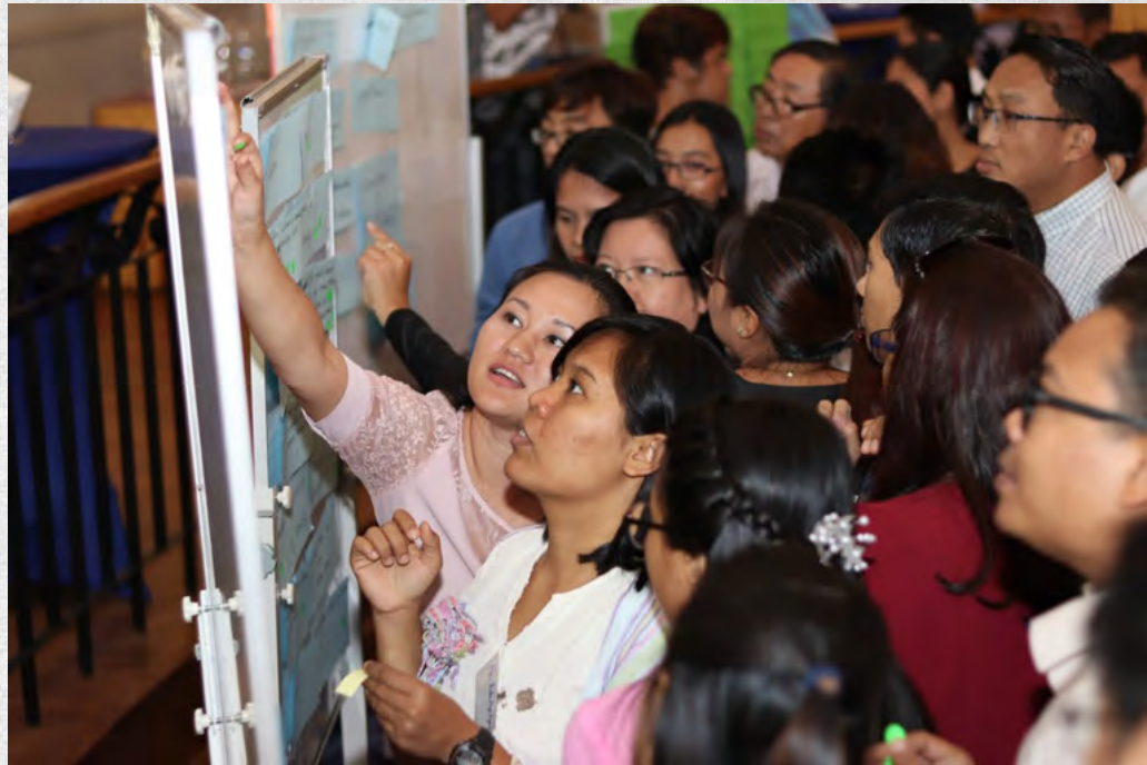
EU-CSO Partnership Strategy Launch event "Shifting Space for Civil Society in Myanmar" in April 2019