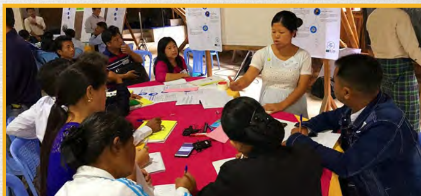
Structured Dialogue on Land Issues, Kachin, September 2019