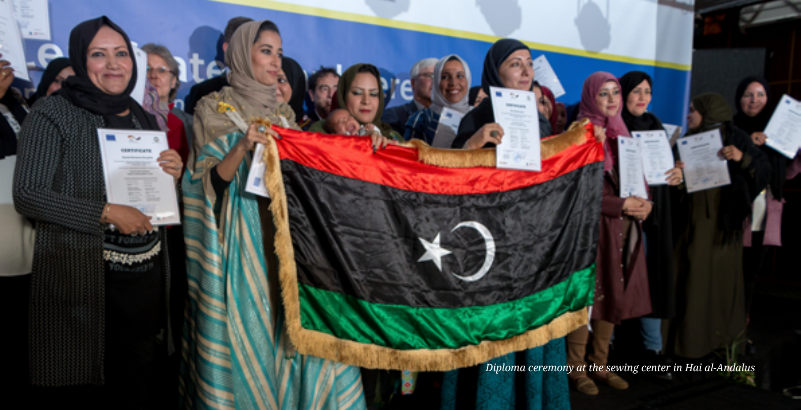
Diploma ceremony at the sewing center in Hai al-Andalus