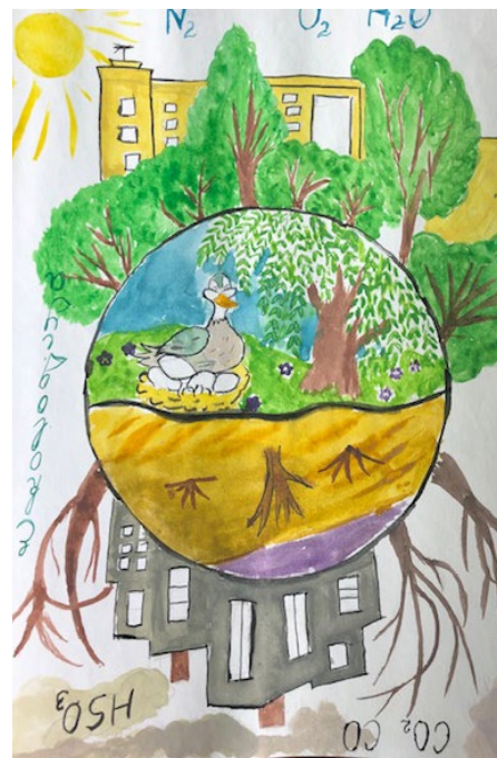
From left to right: 1. Kazakh biosafety specialists use the equipment donated in the frame of Project 53 to detect coronavirus, 2. The Regional Secretariat team at the prizes award ceremony for CBRN drawing competition for children in one of the schools of Uzbekistan, 3. Specialists in biological and chemical safety participate in the regional workshop for Central Asia, organized by Project 65 4. and 5. Some of the drawings submitted for CBRN drawing competition for schoolchildren in Uzbekistan