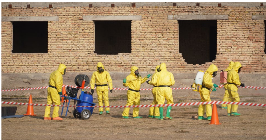
Decontamination team operates after the seizure of "clandestine" laboratory at the Jeyran CBRN Field Exercise, November 2019

A 2 million euro reinforcement for the COVID-19 crisis responsiveness of existing Project 53 has been signed in mid-May 2020 to cover Central Asia but also Southeast and Eastern Europe. It will allow both regions to benefit quickly from complimentary on-line trainings, provision of consumables and equipment. A lessons-learned interregional post-COVID-19 conference will also be organized in cooperation with the Biosafety Association for Central Asia and the Caucasus (BACAC) for the countries of Central Asia and Southeast and Eastern Europe in early 2021, thus strengthening interregional cooperation.