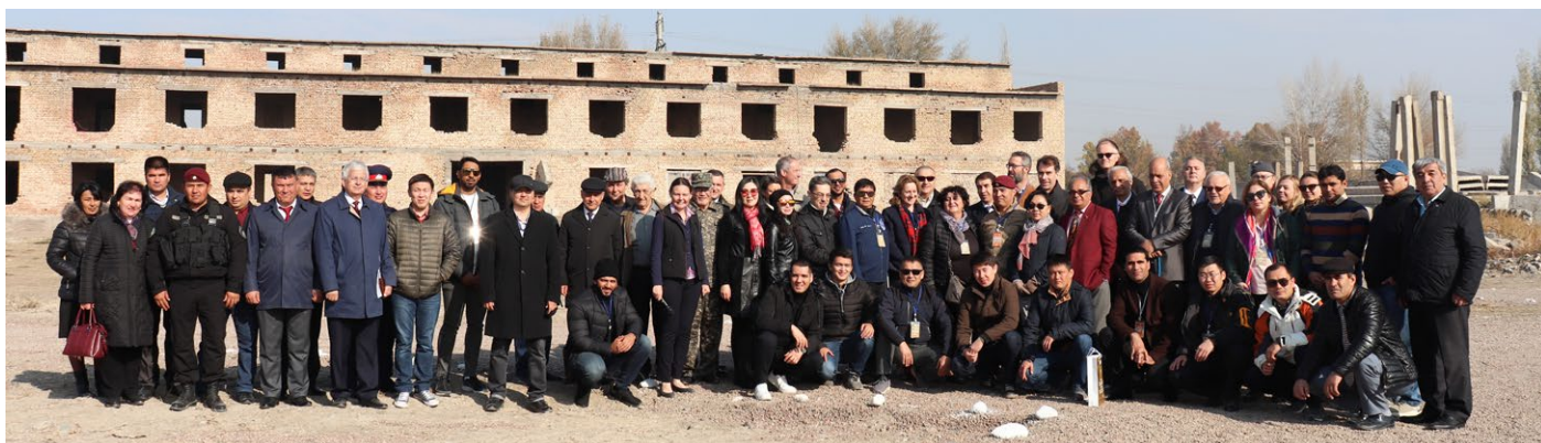
International participants and observers as well as organizers of the CBRN Jeyran Field Exercise in Uzbekistan gather in front of the building used for the exercise, 14 November 2019.

Aikimbayev's National Scientific Center For Especially Dangerous Infections" under the Ministry of Healthcare of the Republic of Kazakhstan received laboratory equipment, which is currently being used for the detection of coronavirus within the population. The Head of the National Reference Laboratory, National TB Center under the Ministry of Health of Kyrgyzstan has sent a letter of appreciation indicating that the training of P53 is being applied for training healthcare workers from hospitals that will be used as COVID-19 treatment units. The Republic of Uzbekistan expects