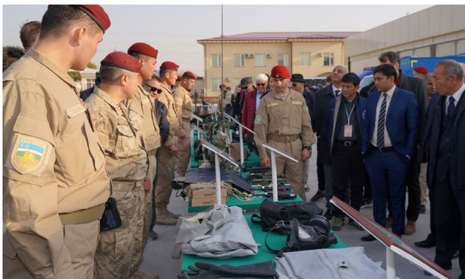
Demonstration of equipment used at the Jeyran CBRN Field Exercise, November 2019