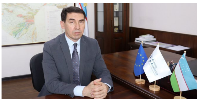
Author: Bakhtiyor Gulyamov