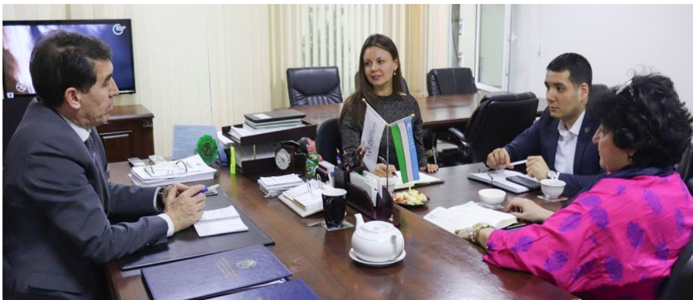
Members of the Regional Secretariat for Central Asia and the National Focal Point of Uzbekistan discuss and plan CoE activities at the regular meeting, Tashkent, Uzbekistan, February 2020