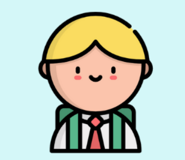
Better learning outcomes with more children finishing full school years and finishing school overall