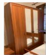
Item 26 - Wardrobe 4 doors with mirrors.JPG