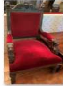
Item 02 - Chair.JPG