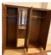
Item 24 - open.JPG