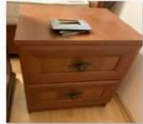
Item 22 - 02.JPG