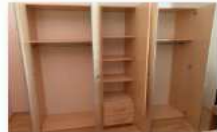
Item 21 - open.JPG