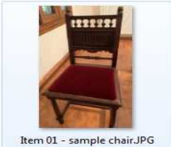
Item 01 - sample chair.JPG