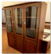
Item 12 - Cupboard with Glass Windows.JPG