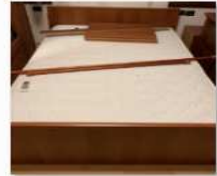
Item 22 - Double bed - Set.JPG