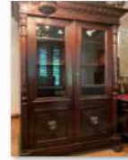
Item 03 - Cupboard.JPG