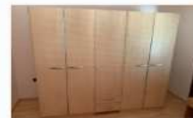
Item 21 - Wardrobe lightbrown.JPG