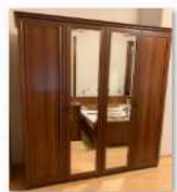
Item 24 - Wardrobe 4 doors with mirrors.JPG