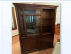
Item 04 - Cupboard.JPG