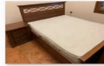
Item 11 - Bed with Drawer .JPG