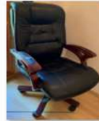
Item 18 - Executive Office Chair.JPG