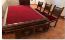
Item 01 - Table with 6 chairs.JPG