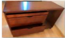
Item 17 - 01.JPG