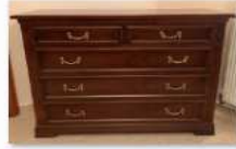
Item 10 - Chest Drawer dark brown.JPG