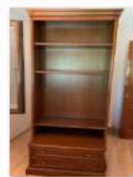
Item 25 - Bookshelf 2 drawers.JPG