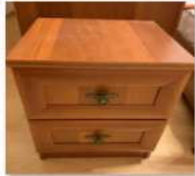
Item 22 - 01.JPG