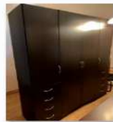
Item 14 - Wardrobe dark brown.JPG