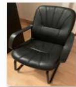
Item 15 - Office Chair.JPG