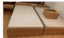
Item 20 - Set of 2 single beds.JPG