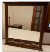
Item 13 - Mirror.JPG