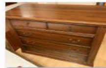
Item 23 - Chest Drawer brown.JPG