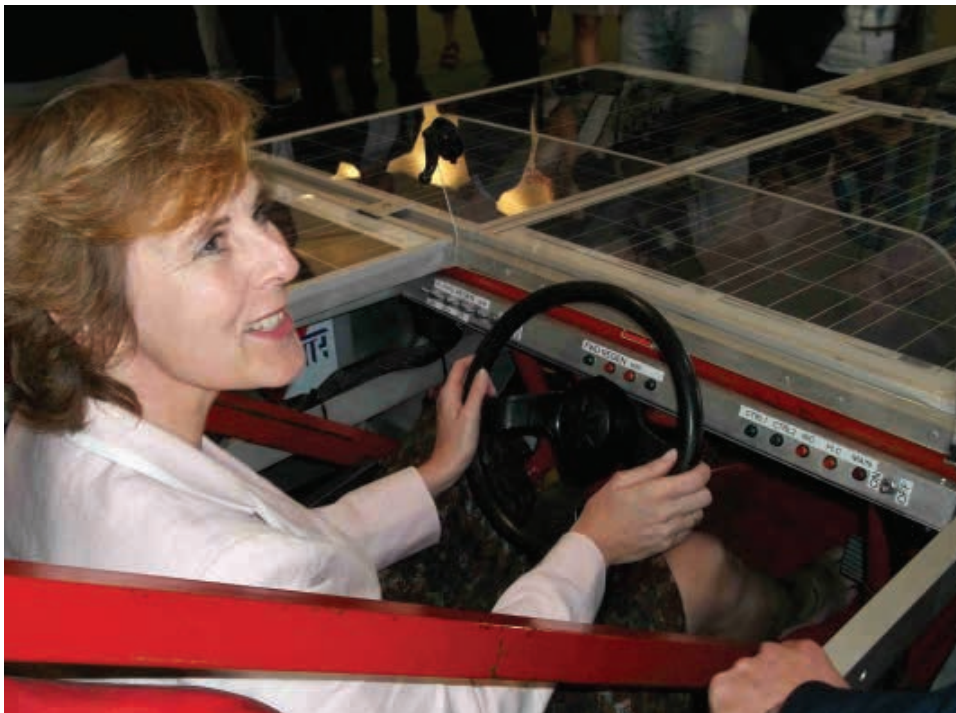
EU Commissioner for Climate Action, Connie Hedegaard, behind the wheel of the solar car designed and built by learners at the German International School in Johannesburg that was exhibited on the EU stand at COP 17 in Durban.

In August 2012, the EU Delegation launched a €7.2 million Call for Proposals entitled “Sustainable Environment and Natural Resources for Development”. Eight grant contracts were concluded with various civil society organisations for projects ranging from waste management and carbon farming to eco-tourism and sustainable agricultural practices.