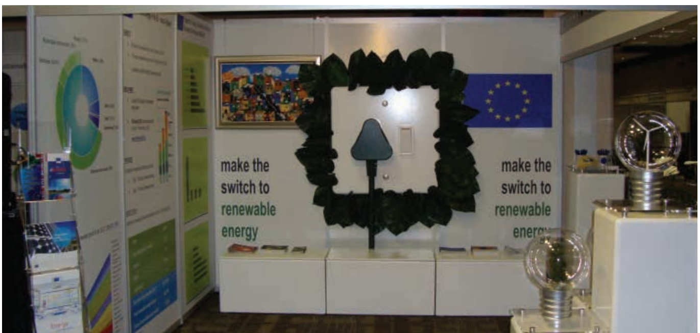
The EU renewable energy stand at the Eastern Cape Renewable Energy Expo.

Annual meetings of the South Africa–EU Forum on