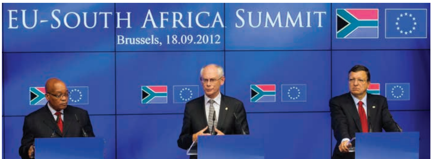
Meeting at the 2012 EU–South Africa Summit (from left to right): President Jacob Zuma (South Africa), President Herman van Rompuy (European Council) and President José Manuel Barroso (European Commission).