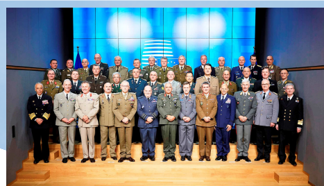
Brussels, 25—25 Oct.: EU Military Committee at Chiefs of Defence level