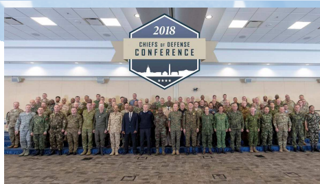
Washington D.C., 14—17 Oct.: Chiefs of Defence Annual Conference