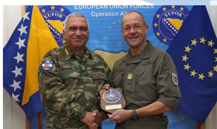
Camp Butmir, 3—4 oct.: Official visit to EUFOR ALTHEA