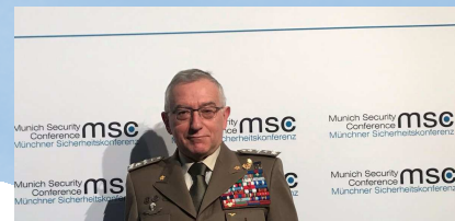
Munich, 21 Feb.: Munich Security Conference