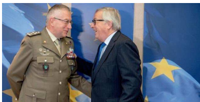
Brussels, 4 Feb.: Meeting with the President of the European Commission