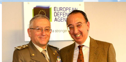
Brussels, 7 Feb.: Meeting with the EDA CEO