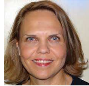
Amb. Sofie FROM-EMMESBERGER PSC Permanent Chair

PSC could in this regard be a catalyst to bring the different EU foreign policy and security actors and tools together