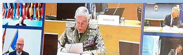
Brussels, 6 April: Video conference of EU Defence Ministers