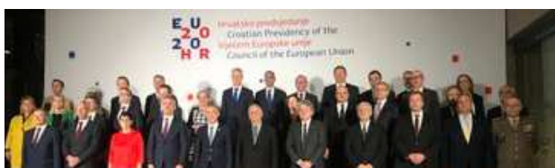
Zagreb, 4-5 March: Informal Foreign Affairs Council (FAC) Defence