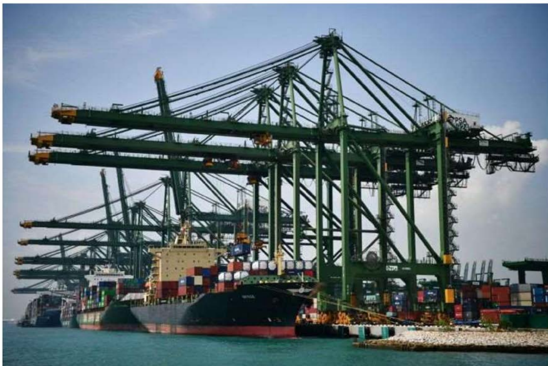
The EU-Singapore Free Trade Agreement came into force on Nov 21, 2019.