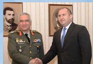
Sofia 24-26 January: CEUMC official visit to the Republic of Bulgaria