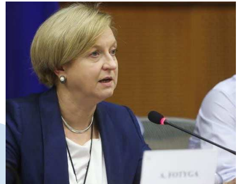
Ms Anna Elżbieta FOTYGA European Parliament Security and Defence Subcommittee (SEDE) Chair

Much has been said about the relations with the US since the start of the Trump administration. However, we continue to share the same beliefs and values and most of the security concerns in regions ranging from the Balkans, to Africa, the Middle East and Asia. The US commitment to European security remains strong. Additional deployments have taken place or are underway in the NATO framework thus underlining the continued strong relationship. Also, on the conflict in Ukraine, the EU and the US stand to-