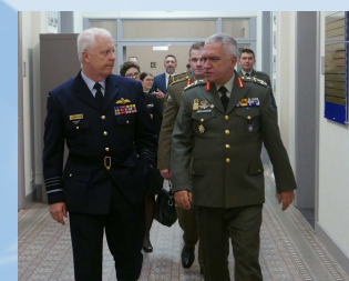
Bruxelles 15 January: CEUMC welcomes the Australian Chief of Defence