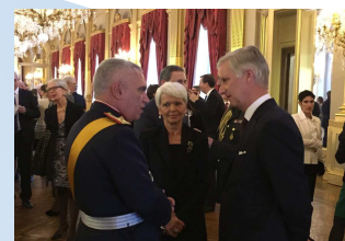
Bruxelles 11 January: CEUMC submits new year wishes to King Philippe of Belgium