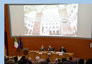
Rome 30-31 January: CEUMC intervention to the Conference "Difesa Europea: quale ruolo per l'Italia"

The views expressed in this newsletter are those of the author and do not represent the official position of the European Union Military Committee or the single Member States' Chiefs of Defence