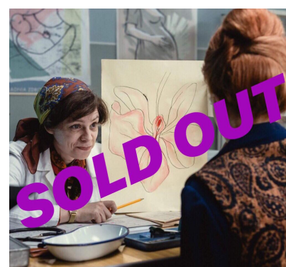
8. The Art of Loving: The Story of Michalina Wislocka - Poland