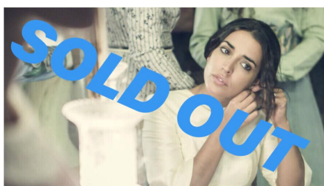
9. The Bride - Spain