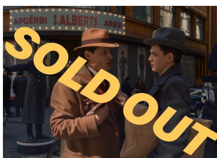
6. Homo Novus - Latvia