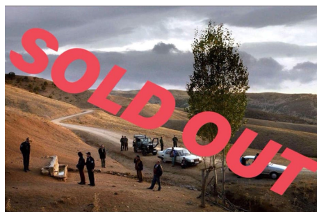
10. Once Upon a Time in Anatolia - Turkey

Most other films had over 80% attendance!