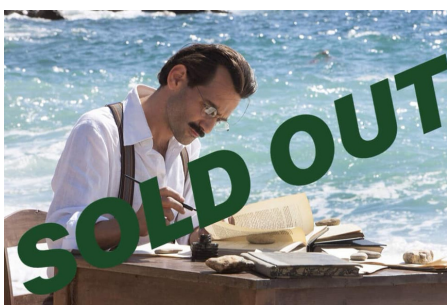
3. Kazantzakis - Greece