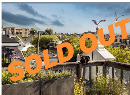
7. The Wild City - The Netherlands