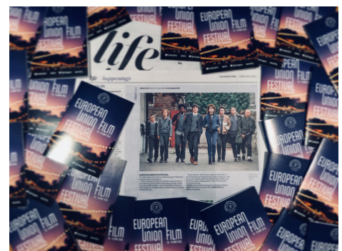
The Straits Times