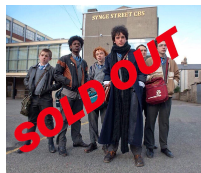
5. Sing Street - Ireland