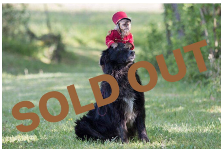
1. Remi, Nobody's Boy - France

10 EUFF films sold out this year, compared to 8 last year.