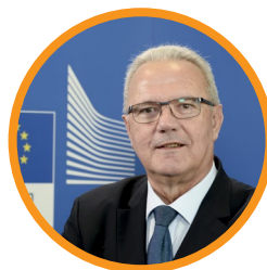
Neven Mimica Commissioner for International Cooperation and Development

DG International Cooperation and Development operates under the guidance of: