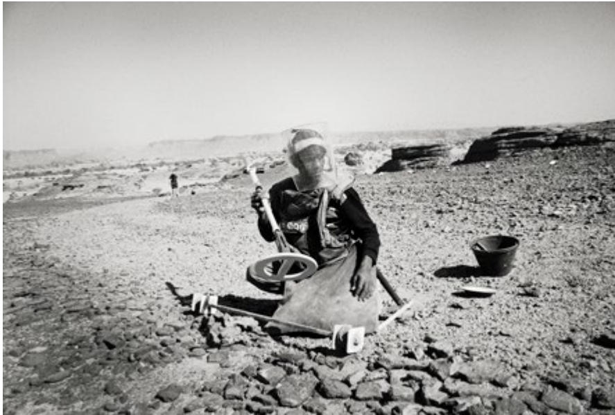
Mine clearance in Chad