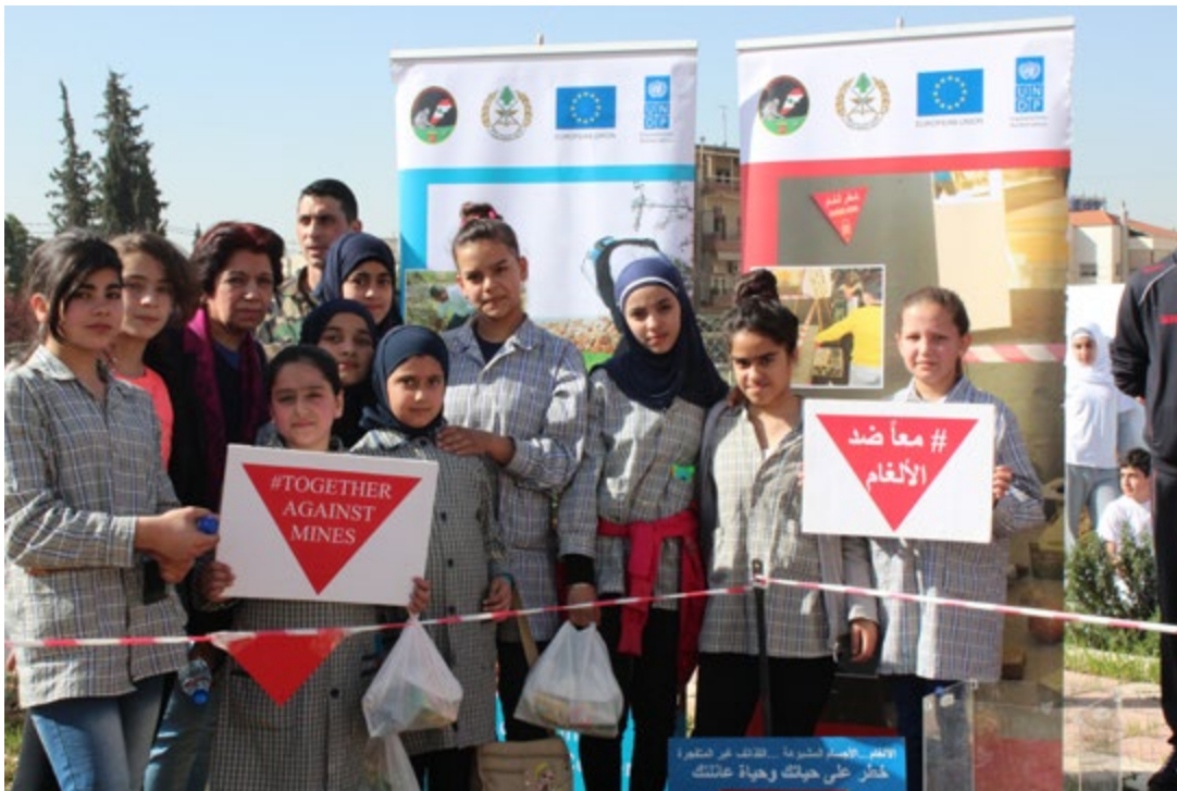
Students gathering in Zahlé during the International Mine Awareness Day in 2017

In addition, the European Union has allocated further funds to the LMAC in support of its capacity enhancement efforts. This support amounts to over EUR 2 million for the 2016-2019 period, implemented by UNDP. The main objective is to support the LMAC in the effective implementation of the Lebanon mine action strategy. Assistance is mainly provided in the areas of strategy and policy planning, of Information Management System for Mine Action (IMSMA), of a regional mine action centre communication room in Nabatieh, of inter-agency and regional coordination, of revision of the National Mine Action Standards (NMAS) and of the establishment of the Regional School for Humanitarian Mine Action (RSHMA).