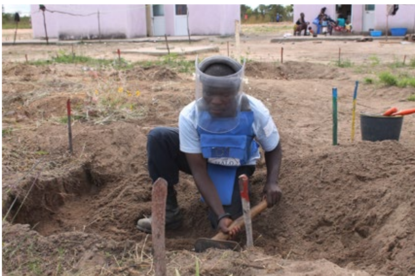
Mine clearance in the proximity of a village in Angola

Thanks to these projects, the European Union assisted Angola towards the fulfilment of its Ottawa Convention commitments and contributed to the improvement of the living conditions of vulnerable groups. Despite these collective efforts, however, both Bié and Kwando-Kubango remain heavily contaminated with landmines, as do the provinces of Benguela, Kwanza Sul, Kwanza Norte and Moxico. As of June 2017, there are still 12 remaining known contaminated areas in the province of Zaire covering approximately 29 000 m 2 of land. The mines continue to kill and injure men, women and children and prevent the rural poor from cultivating land and improving their livelihoods. The national demining authority, the CNIDAH (National Intersectorial Commission for Humanitarian Demining and Assistance), states that 1 074 contaminated areas require clearance and 387 contaminated areas require re-survey, cancellation or clearance.