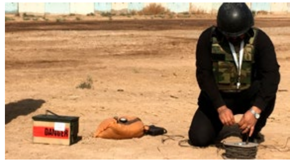
Training on explosive device disposal. Thanks to EU support, UNMAS has led and coordinated since the beginning of 2016 a blended emergency response to address the problem of explosive hazards in retaken areas

The European Union, the United Nations Mine Action Service (UNMAS) and the Iraqi authorities are currently operating a joint project aimed at facilitating the stabilisation and recovery process in areas previously occupied by the so-called Da'esh . By reducing the risks posed by explosive weapons, the project aims at creating the conditions for the sustainable return of internally displaced persons (IDPs). At the same time, UNMAS conducts national capacity building efforts to manage emergency response operations within these areas. These efforts will help create conditions for a safe, voluntary and dignified return of more than 3 million IDPs. In the past year and a half, with the EU playing a key role in coordination, UNMAS has conducted the survey and clearance of more than 18 000 000 m 2 of land in and around Fallujah and around 160 000 m 2 in Anbar Province.