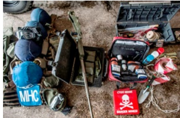
The European Union supports humanitarian mine action in eastern Ukraine

all hazardous areas affected by mines and ERW in order to determine the nature and extent of the contamination.