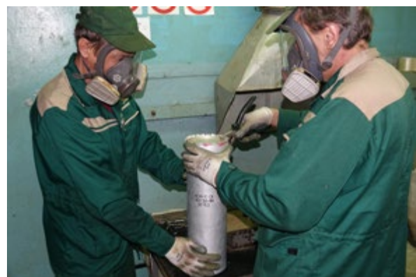
Workers dismantling a stockpile of anti-personnel landmines

In 2016 European Union signed an agreement with the Organisation for Security and Co-operation in Europe (OSCE) for the implementation of the Action 'Supporting Demining of Transport Infrastructure in Ukraine'. The aim of the project is to equip demining experts from the Ministry of Infrastructure with demining and protective equipment and to develop modern training materials, training curriculums, Standard Operating Procedures (SOP) and National Mine Action Standards (NMAS) compliant with IMAS, and to train national instructors. One of the important goals of the project is to develop and adopt Information Management System for Mine Action (IMSMA), install necessary hardware and software and train additional IMSMA users. Since the beginning of the project in November 2016, Ukrainian demining experts have found and destroyed over 10 000 mines and ERW.