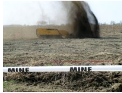
Demining programme in war-affected area. All suspected hazardous areas are marked with mine warning signs

With the signing of the Ottawa Convention, Croatia committed itself to the removal of all landmines and ERW by 2019. These mine clearance activities will greatly contribute to meeting Croatia's international obligation as well as to social inclusion and economic development.