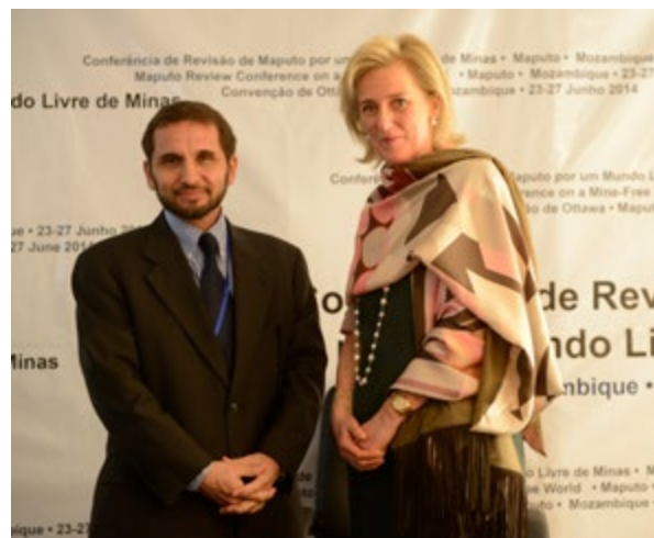
Her Royal Highness Princess Astrid of Belgium and HRH Prince Mired of Jordan at the High Level Segment of the Maputo Review Conference.

of partnership and collaboration between States, non-governmental and other organisations, particularly by working closely with the International Campaign to Ban Landmines (ICBL) and others.