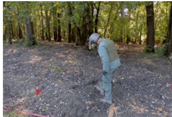
Mine clearance in Croatia. It is estimated that there are still over 39 200 mines in the country

demined in all nine counties by the end of 2018. Cromac takes part in these mine clearance activities as a technical assistance partner.