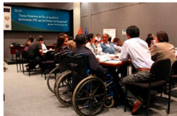
Victim Assistance Workshop in Peru

The Council Decision also provided resources to the ISU to support the organisation of a global conference on assistance to the victims of landmines and other explosive remnants of war. On 3–4 April 2014, the ISU joined forces with Colombia in organising the conference "Bridges between Worlds" in Medellin (Colombia). This conference was held