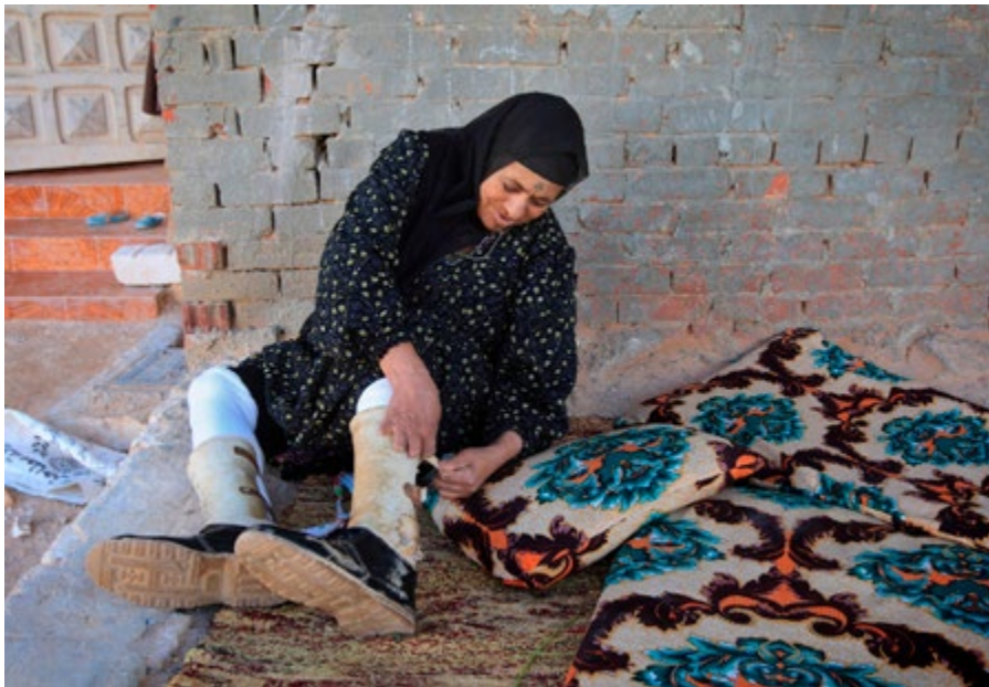
The establishment of an artificial limbs fitting and maintenance centre in Matruh benefits survivors of landmine/ ERW accidents in Egypt

In addition, capacity building trainings were provided to five local non-governmental organisations. Two MRE campaigns were also organised for the benefit of more than 85 000 inhabitants, including students, teachers, opinion leaders, and community leaders, and 11 trainings were organised for trainers along the north-west coast.