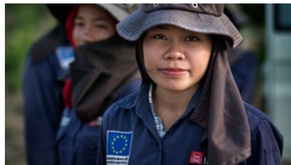
UXO Lao teams, including all-female clearance teams in Xieng Khouang, use modern and efficient survey methodologies to determine the level of contamination

The EU - UNDP joint project had an important effect on the local context: a total of 17 564 000 m 2 was cleared by all humanitarian operators, out of which 13 730 000 m 2 and 383 400 m 2 were released for agriculture and other development purposes respectively. Out of this, UXO Lao cleared a total of 7 971 000 m 2 : 6 839 000 for agriculture and 1 132 000 for other development purposes. During the project phase, the survey methodology changed from request-based survey procedures to evidence-based survey procedures, enabling a more efficient way of clearing. There has been a four-fold increase in the number of cluster munitions found per hectare. In addition, 2 146 MRE sessions were attended by over 694 938 people.