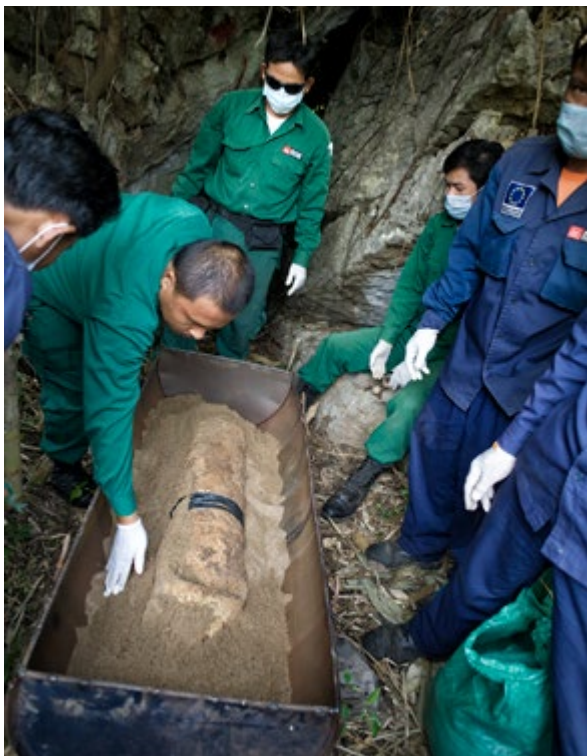
Identification of cluster munition in Xieng Khouang, the province with the highest UXO casualty rate in Lao PDR

The 8th national socio-economic development plan includes targets for addressing the UXO issue by 2020. The National Regulatory Authority for the UXO/Mine Action Sector (NRA) has also approved its own 5-year plan, with targets relating to UXO survey, reduced casualties and victim assistance. Furthermore, the Government launched in September 2016, together with the UN Secretary-General, the local project on the Sustainable Development Goal (SDG) No 18 to remove the UXO obstacle to national development.