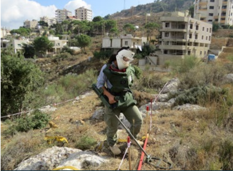
DCA female deminer conducting mine clearance activities in Lebanon