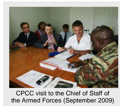
CPCC visit to the Chief of Staff of the Armed Forces (September 2009)

The approval of these laws is a consequence of almost two years of close and daily cooperation with the national authorities in accordance with the EU SSR Guinea-Bissau mission mandate. The Mission also carried out numerous communication activities and education on SSR and helped the topic to become a national priority. The mission's objectives have thus been successfully achieved. The Government of Guinea-Bissau is the owner of the reform and must decide on its implementation. It now has a solid legal framework to start implementing the national SSR strategy, restructure the Armed Forces and establish new Police Bodies.