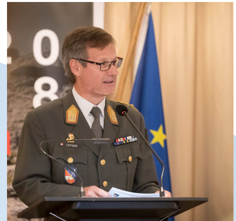
Lieutenant General Franz Leitgeb Austrian MILREP

will build the basis for future implementation;