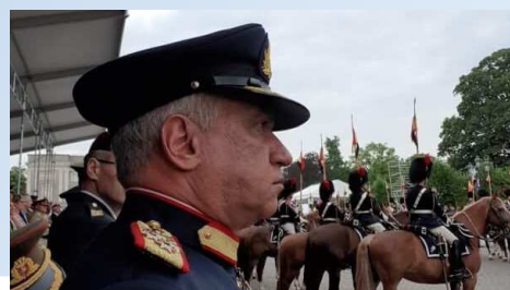
Brussels, 21 July: National Day of the Kingdom of Belgium