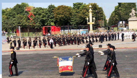
Paris, 14 July: French National Day