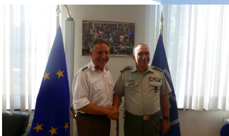
Brussels, 6 July: Meeting with the newly appointed UK Chief of the Defence Staff