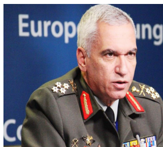
Gen. Mikhail Kostarakos

Since the European Union Global Strategy has been launched, in June 2016, considerable progress has been made in fulfilling the EU's level of ambition in the area of Security and Defence, thus enhancing the Union's ability to act more and more as a security provider and strengthening its strategic role on global scale.