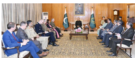
CEUMC pays an Official Visit to Pakistan (5-8 November)