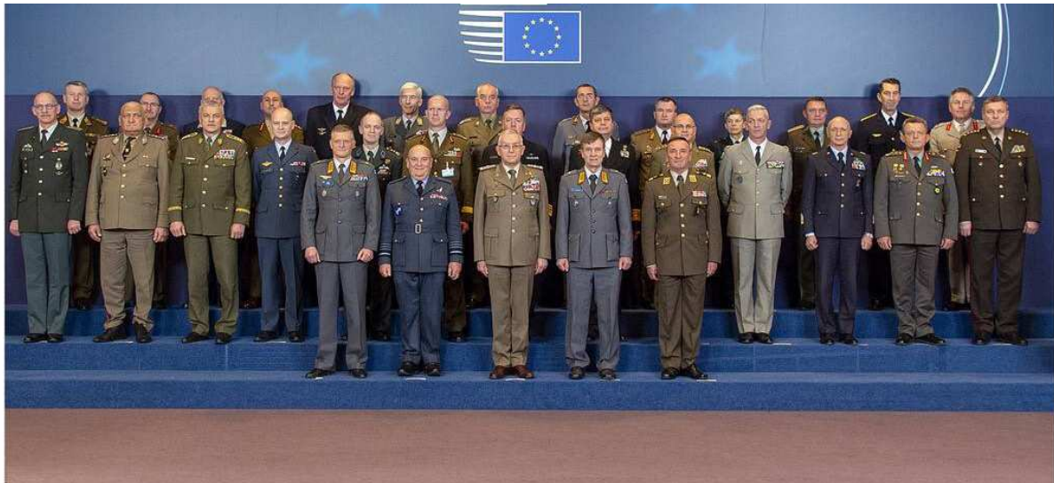
EU Military Committee in the format of Chiefs of Defence (CHODs) - Family photo