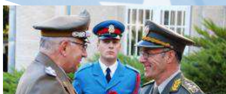
CEUMC at the Berlin Security Conference 2019 (25-27 November)