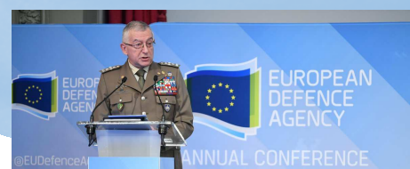
CEUMC at the EDA Annual Conference (28 November)