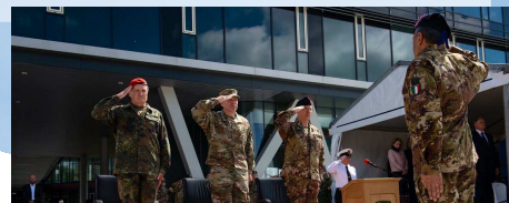
Brunssum (NL), 31 May: HoTo Ceremony Force Commander NATO Allied Joint Force Command