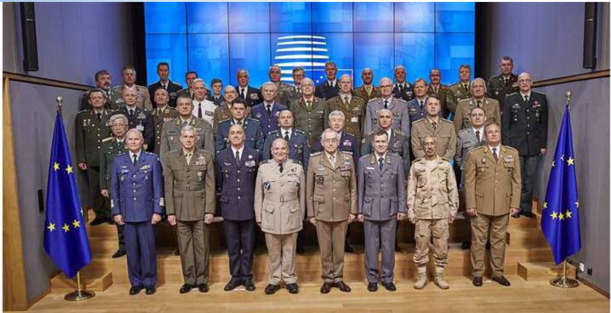
EU Chiefs of Defence (CHODs) Conference May 2019 — family photo