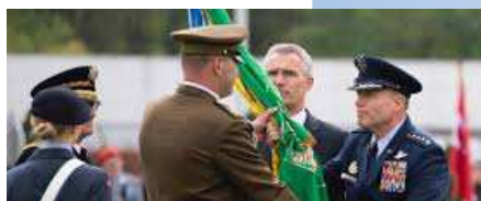
SHAPE, 3 May: Change of Command for NATO Allied Command Operations (SACEUR)