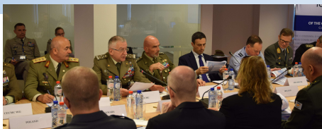
Brussels 7 May.: EU Military Committee Mini Away Day