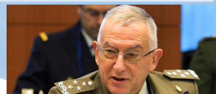
16 June: Video conference of EU Ministers of Defence