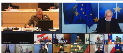
13 May: "virtual" meeting in Chiefs of Defence (CHODs)