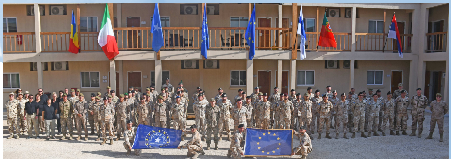
ET Training Mission-SOMALIA

Once it is deemed safe to do so, the Mission will return to its original configuration and resume its mandated activities as before.