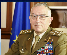
Gen. Claudio Graziano