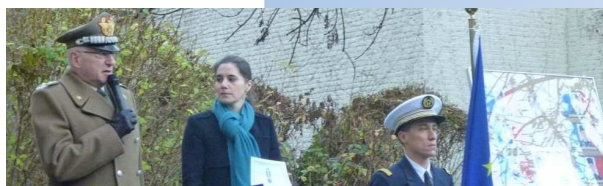
EU ceremony to honour the French soldiers that died on operation in Mali on 25 Nov (Bruxelles, 2 December)