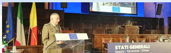
Convention on Space, Security and EU Defence (Naples, 6 December)