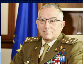
Gen. Claudio Graziano