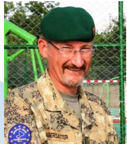
Brigadier General Christian Habersatter

EUTM has trained the officers of the recently set-up first ever Malian PCIAT (Poste de Commandement Interarmées de Théâtre – Theatre Headquarters) after a specific request by the Malian Armed Forces. From the 2nd to the 6th of September 2019, officers from the PCIAT Centre in Sévaré attended a training course led by EUTM Mali Advisory Task Force (ATF). Its objectives are to enable the PCIAT Centre to cooperate and share intelligence within the operational domain, conduct planning at the operational level, monitor information and perform the "battle rhythm" in a methodical manner. The modules taught during this instruction include the importance of CIMIC, information management, operational messaging, the intelligence cycle and the Operational Deci-