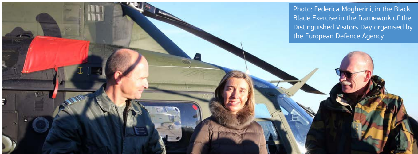
Photo: Federica Mogherini, in the Black Blade Exercise in the framework of the Distinguished Visitors Day organised by the European Defence Agency

1. Respond to external conflicts and crises, by conducting civilian and military operations or missions more effectively and rapidly.