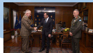
Athens, 6-7 February: Official visit to Greece