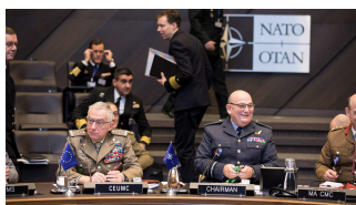
Brussels, 15 Jan: NATO MILITARY COMMITTEE CHODs Session