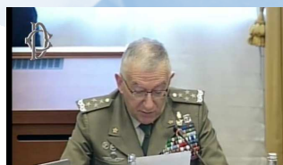
Rome, 30-31 Jan: Hearing in the Italian Parliament