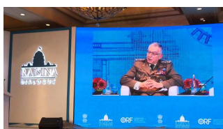
New Delhi, 16-18 Jan: RAISINA DIALOGUE