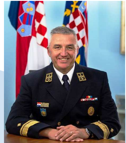
Rear Admiral Predrag Stipanović

In this regard, the Presidency will promote continuation of the strategic debate on further development and modalities for enhancing European defense cooperation. “Stronger EU – NATO cooperation, including transatlantic relations” is the second priority. The objective of this priority is to continue working on close and concrete cooperation between the EU and NATO, as two key components in the context of European security, and to provide a meaningful contribution to transatlantic relations. In addition, it is to ensure the continuity of cooperation and action between EU and NATO, as one way of retaining credible transatlantic and European security and defense guarantees. The third priority is “Industrial and research domain – enhancing defense industry competitiveness, role of small and medium sized enterprises (SMEs) and research capacities” . This priority is to further development of the European defense industry and defense research capacities through the EDF, whilst ensuring sufficient resources in the upcoming Multi-annual Financial Framework. A special emphasis will be given to SMEs and their access to cross border supply chains, while keeping in mind the affirmation of national capacities, an even and fair development of the defense industry in Europe.