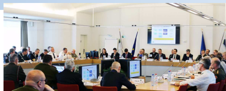
Brussels 3 Apr.: EU Military Committee visit to the European Defence Agency (EDA)