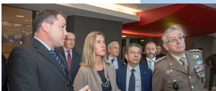
Brussels 1 Apr.: official opening of the SatCen Exhibition at the EEAS