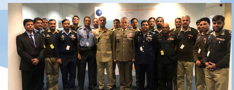
Brussels, 23 Apr.: Study visit of Pakistani National Defence University