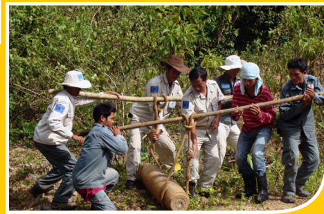
EU assistance to UXO clearance.