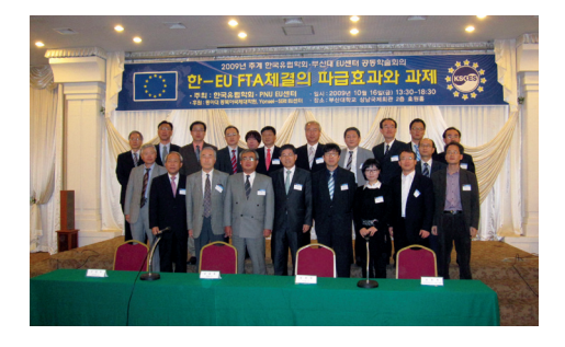
PNU EU Center • KSCES Academic Conference under the title of "Ripple effect and challenges of Korea-EU FTA" (October 2009)