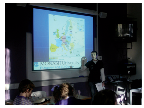
Monash European and EU Centre - June 2008

The Centre organizes public lectures, seminars and videoconferences on Europe and the EU; advises opinion leaders in business, government and the media through briefings and seminars; is developing an outreach programme for secondary school students and holds academic and policy conferences, symposia and roundtables. It offers prestigious yearly essay prizes to university students and works closely with representatives of European communities in Australia towards building a strong European network.