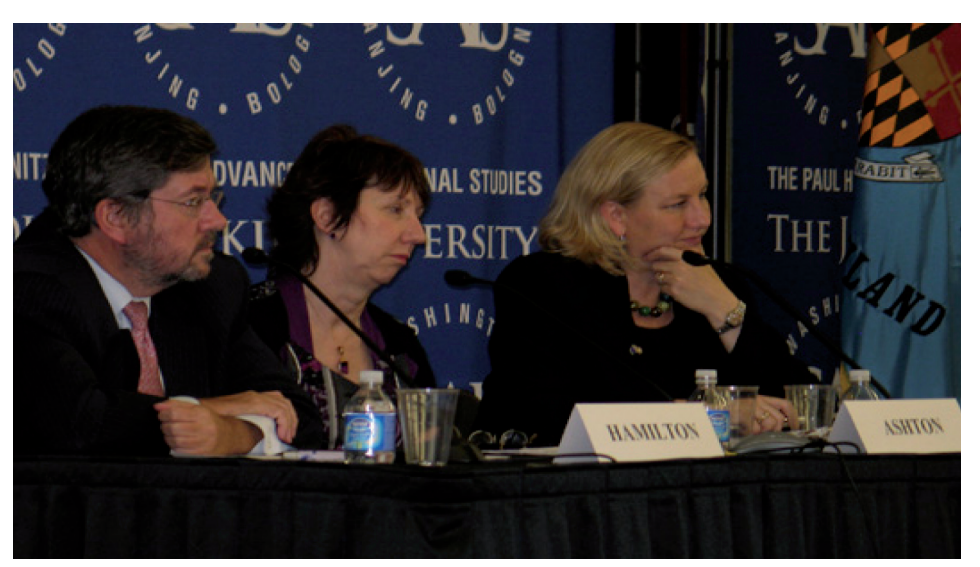
ACES hosts European Commission President José Manuel Barroso, Baroness Catherine Ashton (then European Trade Commissioner), and Swedish Trade Minister Ewa Björling, 26 October, 2009