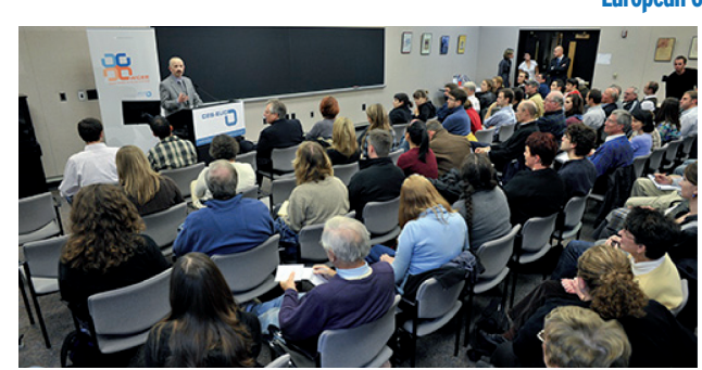
EUCE-MI "Conversations on Europe" lecture, October 2009

Highlights of 2008-09 were visits to U-M by Donatella della Porta (EUI Florence), March 2009, and Leoluca Orlando, former mayor of Palermo, February 2009; and International Workshop: Towards a European Higher Education Area: Bologna Process and Beyond, March 2009.