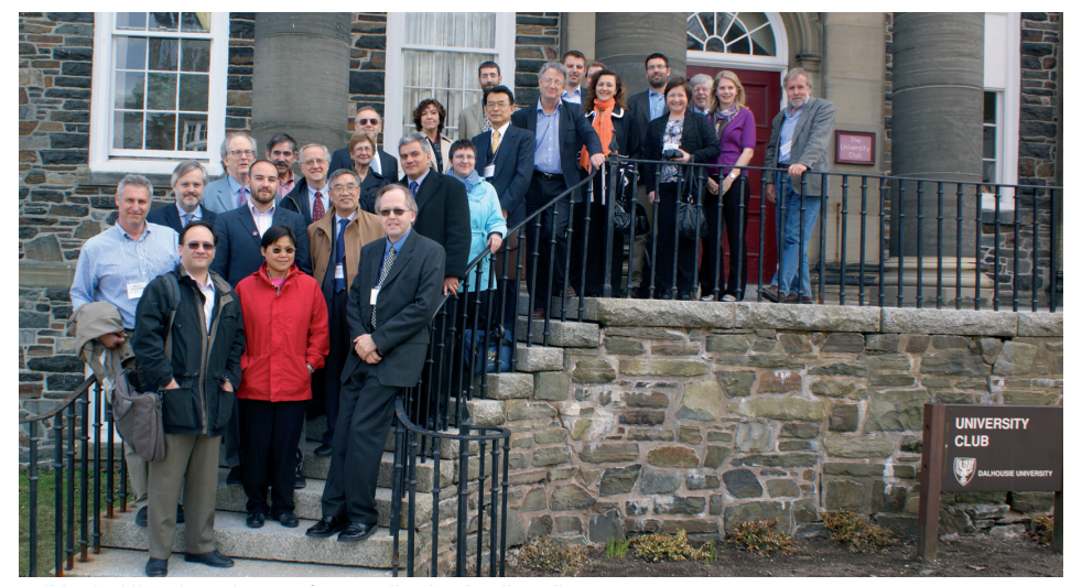
Participants at the 3rd annual EUCE conference, Dalhousie University, April 2009

The following books have been published under the auspices of the EUCE: The Rise and Fall of the EU's Constitutional Treaty (Leiden: Nijhoff, 2008), The EU as a Foreign and Security Policy Actor (Dordrecht: Republic of Letters Publishing, 2009) and The EU in the Global Political Economy (Brussels: P.I.E. Peter Lang, 2009). Two more books will be published in the near future: Comparative Regional Integration: Europe and Beyond (Ashgate, 2010) and The EU and Federalism: Polities and Policies Compared (Ashgate, 2010).