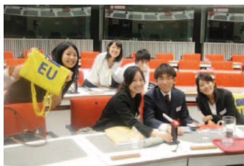
At the European Commission, August 2011