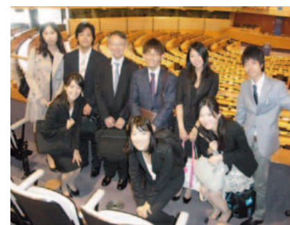
At the European Parliament, August 2011