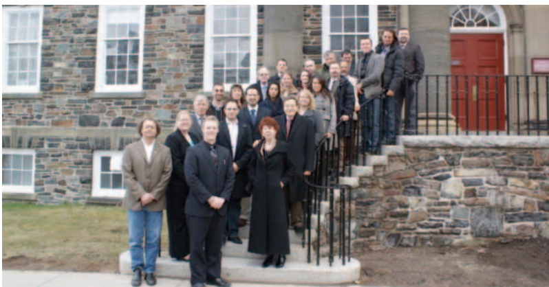
Participants of the 6th annual EUCE conference, Dalhousie University, April 2012

The following four books are forthcoming: The EU and the Political Economy of Transatlantic Relations (Brussels: P.I.E. Peter Lang), The EU, Security and Transatlantic Relations (Brussels: P.I.E. Peter Lang), The EU and the eurozone Crisis: Policy Challenges and Strategic Choices (Farnham: Ashgate), and EU Enlargement: Current Challenges and Strategic Choices (publisher to be determined).