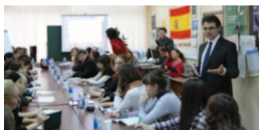
Students' Euro-club workshop, March 2012