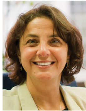
DANIELA TRAMACERE Minister Counsellor & Chargé d'Affaires DELEGATION OF THE EUROPEAN UNION TO TRINIDAD & TOBAGO

The European Union continues to work with the Government of Trinidad and Tobago in the achievement of its national development goals and we are happy to report that substantial progress has been made in the efforts to help bridge the