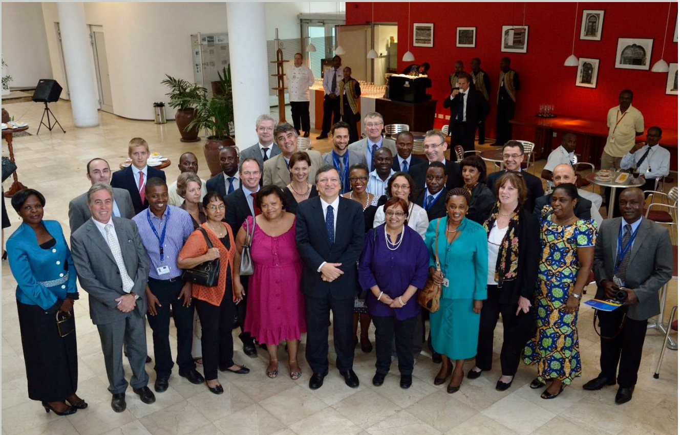
President Barroso (centre) posing for a group photograph with the staff of the European Delegation at Umoja House.

The trip was hailed as a great success, with Tanzanian and EU officials both celebrating the existing cooperation between Tanzania and the EU, and pledging increasing cooperation and dialogue in the future.