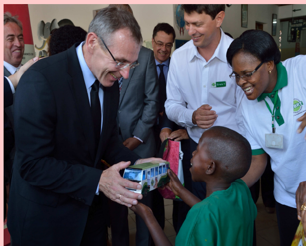
Clockwise, from top left: President Barroso and Commissioner Piebalgs seeing CCBRT's work first-hand; Commissioner Piebalgs is presented with a gift by a young patient; the delegates pose for a group photo with the CCBRT staff