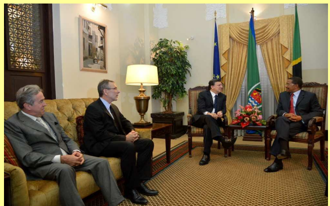
Ambassador Sebregondi and Commissioner Piebalgs were also present for the talks

The Tanzanian President highlighted his government's commitment to strengthen the long-standing cooperation between Tanzania and the EU, and said he looked forward to increased cooperation in the future.