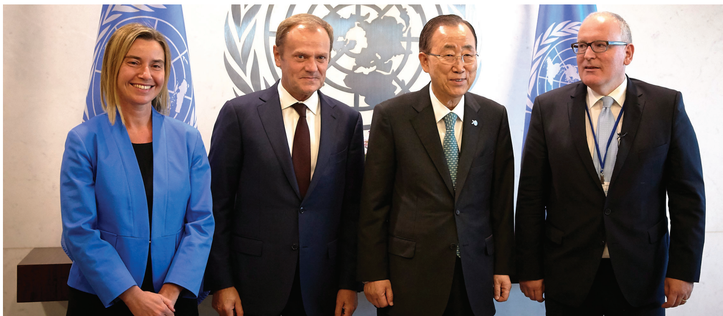
Picture caption: (L-R) High Representative for Foreign Affairs and Security Policy and Vice-President of the Commission Federica Mogherini, President of the European Council Donald Tusk, Secretary General of the United Nations Ban Ki-Moon, and First Vice President of the European Commission Frans Timmermans.

On 25th September, the United Nations adopted the 2030 Agenda for Sustainable Development, the first ever global agreement setting a universal, comprehensive agenda for action on development. First Vice President of the European Commission Frans Timmermans, High Representative for Foreign Affairs and Security Policy and Vice-President of the Commission Federica Mogherini, and Commissioner for International Cooperation and Development Neven Mimica, joined more than 150 Heads of State and Government from all over the world, in the historic event.