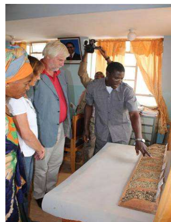
From left 1. At Maruku Agricultural Research Centre, 2. Handing over a certificate of registration to Ikuza Fishing Cooperative Society leader, Holding the mic is Prof. Tibaijuka. 3. Checking on coffee varieties at Bukop.