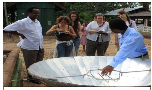
Being briefed about a solar power equipment at TATEDO in Dar es Salaam

International, Tanzania Traditional Energy Development and Environment Organisation (TATEDO), Radar Development, the European Committee for Training and Agriculture (CEFA), and Comprehensive Community Based, Rehabilitation in Tanzania (CCBRT). Besides, they also visited the National Authorising Office at the Ministry of Finance, IPP Media and the University of Dar es Salaam School of Journalism and Mass Communication SJMC).