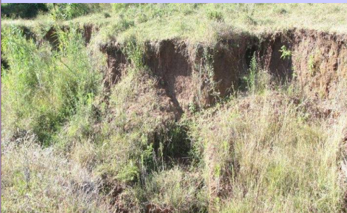
An area affected by erosion at Mwansekwa area in Mbeya

These activities were a continuation of celebrations to mark the European Year of Volunteering that were launched in May this Year. In May both GNRC and Jane Goodall/Roots and Shoots kick-started their activities in Dar es Salaam where they mobilised efforts to help a local school to mitigate floods on the school compound by erecting sand barriers.