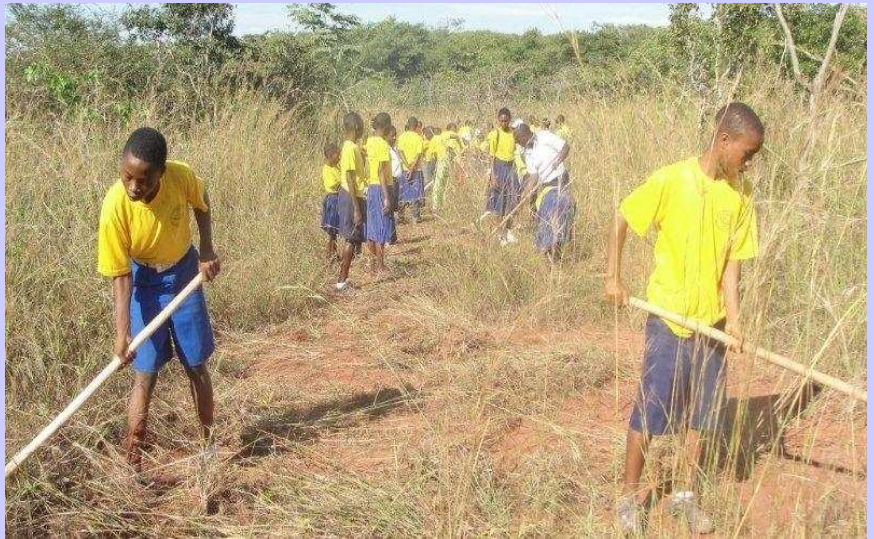
School children busy creating fire breaks within the Katwe Forest Reserve in Kigoma

Unguja children, youth and members of the general public took on an environmental cleanliness campaign whereby by a