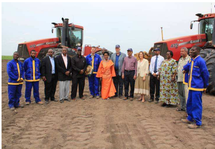
Visiting Kagera Sugar Ltd. plantations