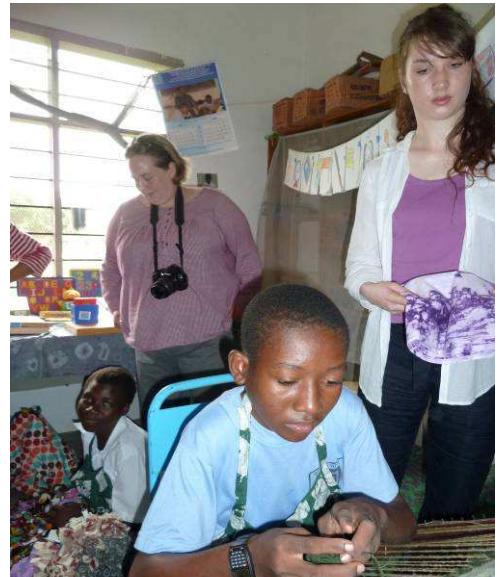
Visiting children with disabilities at Buguruni Primary School in Dar es Salaam