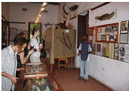
Touring the Roman Catholic Church Museum in Bagamoyo

During their visit in Tanzania, the reporters visited EU-supported projects and EU partner organisations in Dar es Salaam, Bagamoyo and Zanzibar. The visited organisations included Tanzania Media Women Association (TAMWA), Sense