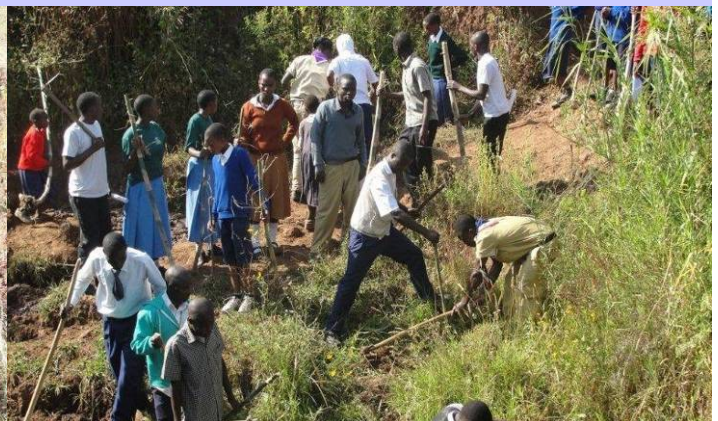
School children and youth planting bamboo trees and vertiver grass to mitigate erosion in the area.