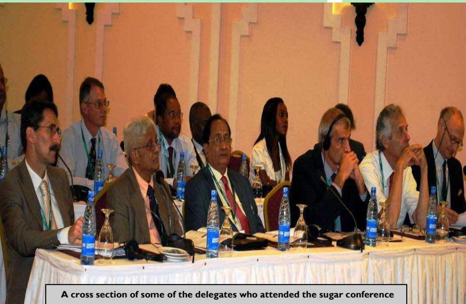
A cross section of some of the delegates who attended the sugar conference

He said that he was proud that the EU-supported programme in this sector has brought prosperity to many small-scale sugar producers and hope we can continue to expand our support in the future, bringing more and more farmers and their families out of poverty.