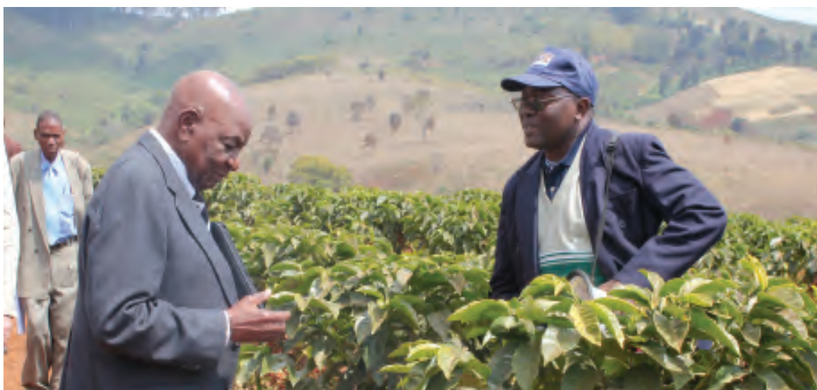
Former Minister for Finance and the first Governor of the Bank of Tanzania, Edwin Mtei admires ripe coffee beans at a demonstration farm at Ugano Village, in Mbinga District, Songea Region. This was during the inauguration day of facilities of Ugano coffee research substation in July.