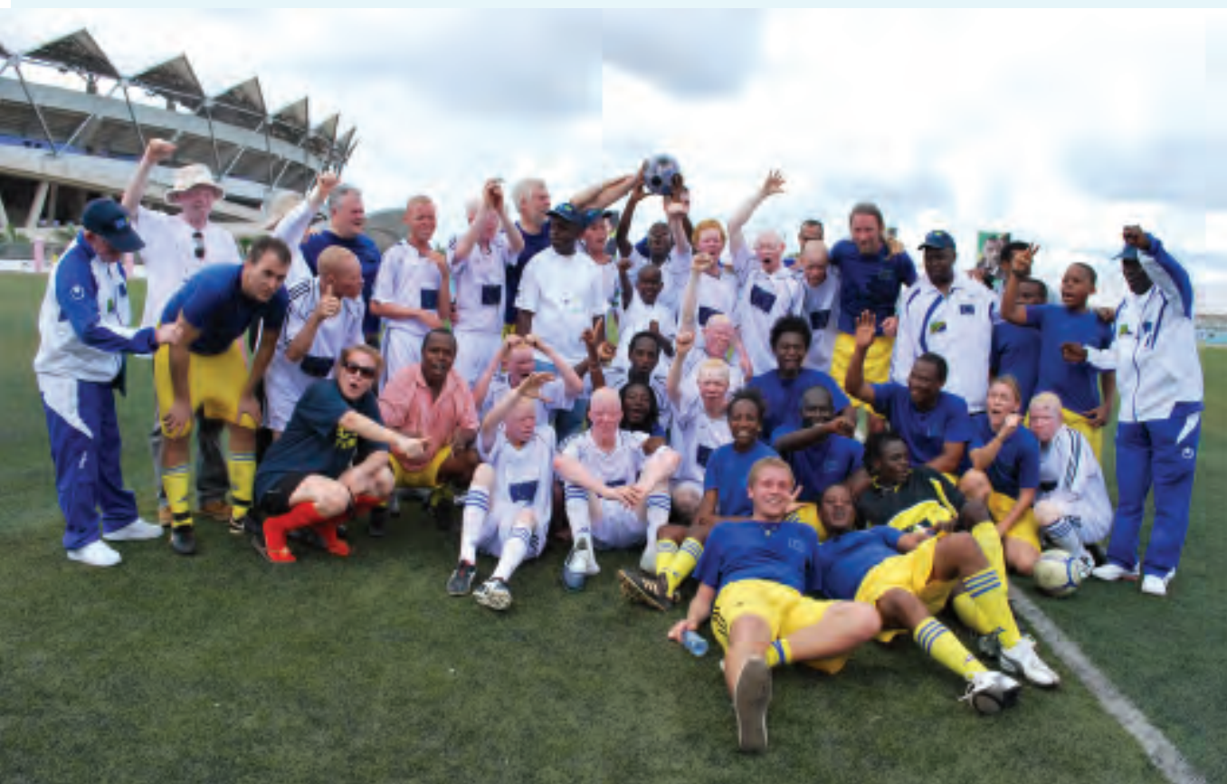
Albino United and the Euros players after a football match to mark the beginning of EU week at Uhuru stadium with the financial support of the European Commission.