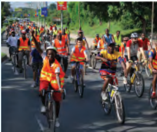
A Cycle Caravan in one of the Dar streets. UWABA Cycling Community organised the 2010 Dar es Salaam Cycle Caravan as part of Europe Week which took place in May.