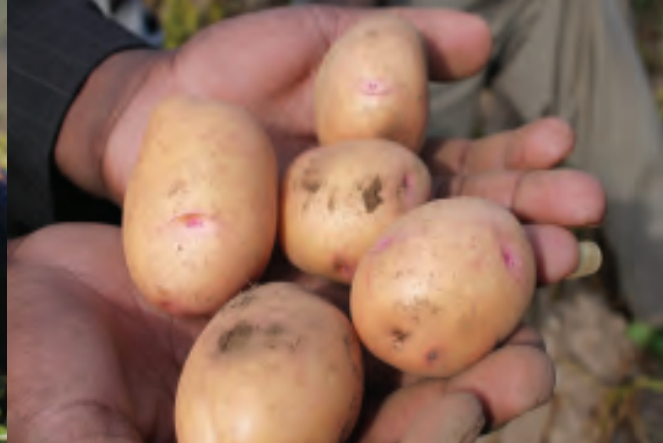
Potato farmers at a demonstration plot of improved Irish (round) potatoes at Bomalang'ombe Village in Kilolo district, Iringa Region. Demonstration plots for the new variety of Irish potatoes are under Sustainable Agriculture Against Food Insecurity (SAAFI) project which is financed by European Commission and implemented by CEFA.