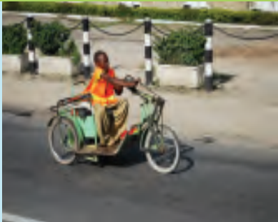
Not to be outdone, he made it to the final point

UWABA Cycling Community organised the 2010 Dar es Salaam Cycle Caravan as part of Europe Week which took place on 9th May 2010 starting from Mnazi Mmoja.