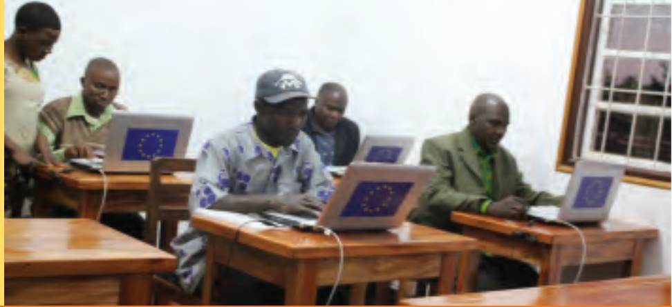
A computer class of the centre for Agriculture and Livestock Development at Mahinya Msindo Village in Namtumbo District, Ruvuma Region. The centre is under a Sustainable Agriculture Against Food Insecurity (SAAFI) project run by an Italian NGO, CEFA under the financial support of the European Union