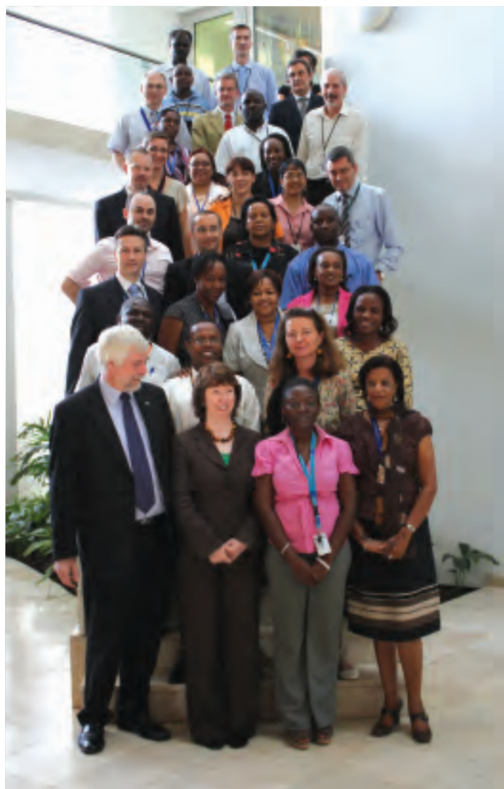
The EU's High Representative for Foreign Affairs and Security Policy, Catherine Ashton (2 nd left, front row) in a group photo with EU Delegation staff.

While in Tanzania, Baroness Ashton met President Jakaya Kikwete and Foreign Minister Bernard Membe. She later held a meeting with the press at which she said the EU recognised that piracy was a symptom of instability in Somalia and