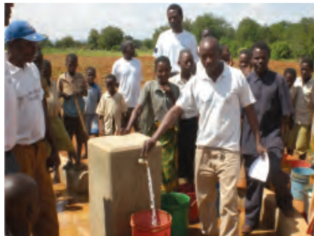
At last water is flowing! Residents of Chinangali B Village drawing water from a water facility project in their village that is supported by the European Commission.

Thanks to the Project entitled "Joining efforts in increasing access to safe, affordable and sustainable water and sanitation services in Kongwa and Chamwino Districts in Dodoma Region, Tanzania", funded by the European Union and