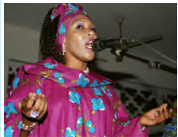
A taarab songbird in action