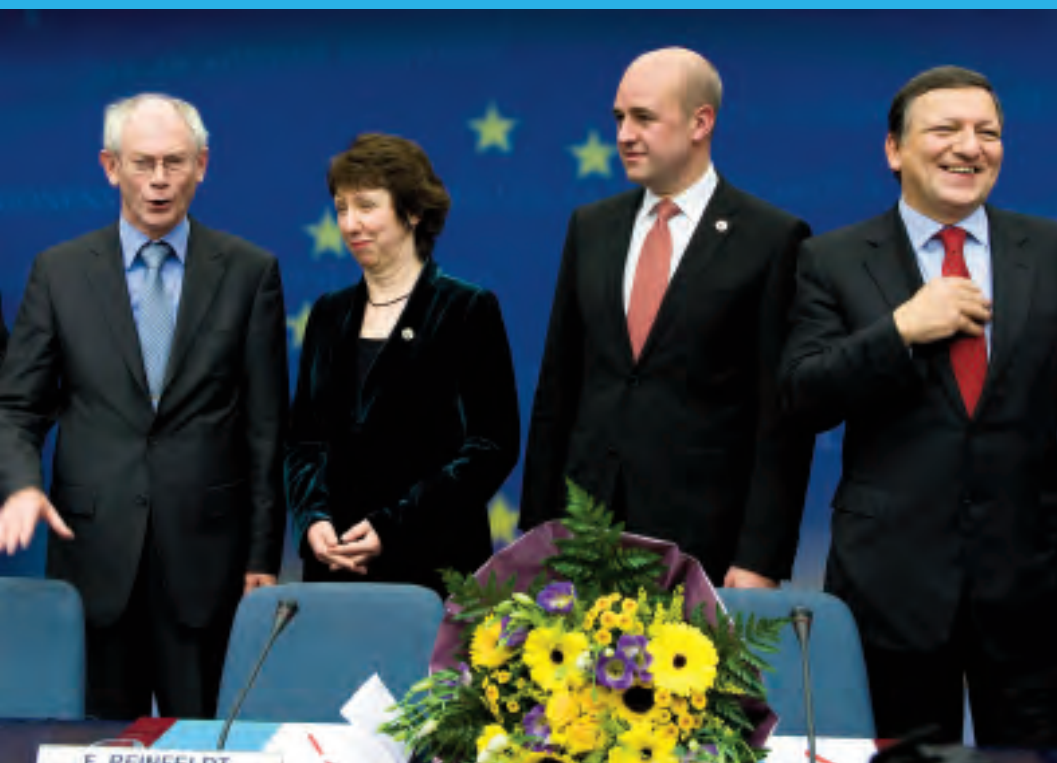
(from left to right) Mr Herman VAN ROMPUY, President of the European Council, Ms Catherine ASHTON, High Representative Mr Fredrik REINFELDT, Swedish Prime Minister, President of the European Council, Mr Jose Manuel DURAO BARROSO, President of the European Commission