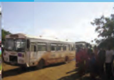
A bus transporting Burundian refugees back home.