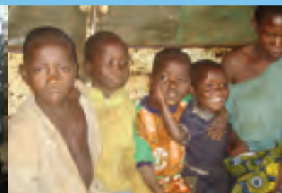
Children smile, not knowing what waits them back home

Miaki B village, road 2B House number 5 is not like any other house in the neighbourhood, as we are approaching the premises, we are greeted by chickens and ducks running around the premises; on the other side a group of children are playing jovially, by all means it is a happy and peaceful atmosphere.