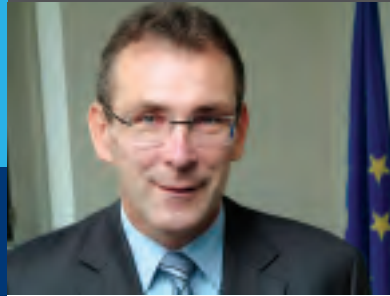
Andris Piebalgs, new European Commissioner for Development

Katumba refugee camp, we have never been to Burundi but we know we will start a new chapter of our life happily.