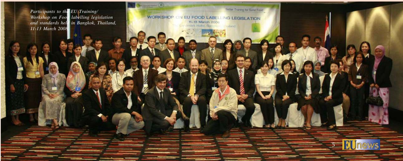
Participants to the EU Training/ Workshop on Food labelling legislation and standards held in Bangkok, Thailand, 11-13 March 2008.

a special sanitary and phytosanitary issue