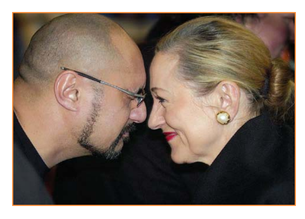
European Commissioner for External Relations Benita Ferrero-Waldner during her visit to New Zealand, June 2007.

The Joint Declaration on Relations and Cooperation between the European Union and New Zealand, which was adopted on 21 September 2007, is the basis of the bilateral relationship. The agreement highlights both parties' commitment to strengthen further their relationship across a broad range of fields.