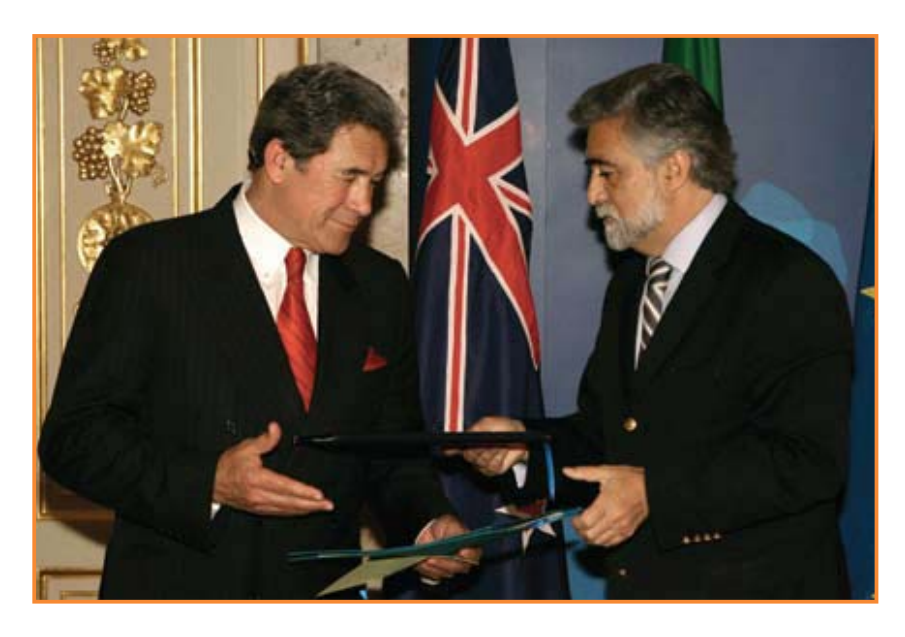
Former New Zealand Foreign Minister Winston Peters and Portuguese Foreign Minister Luís Amado at the Joint Declaration's adoption, Lisbon, September 2007.