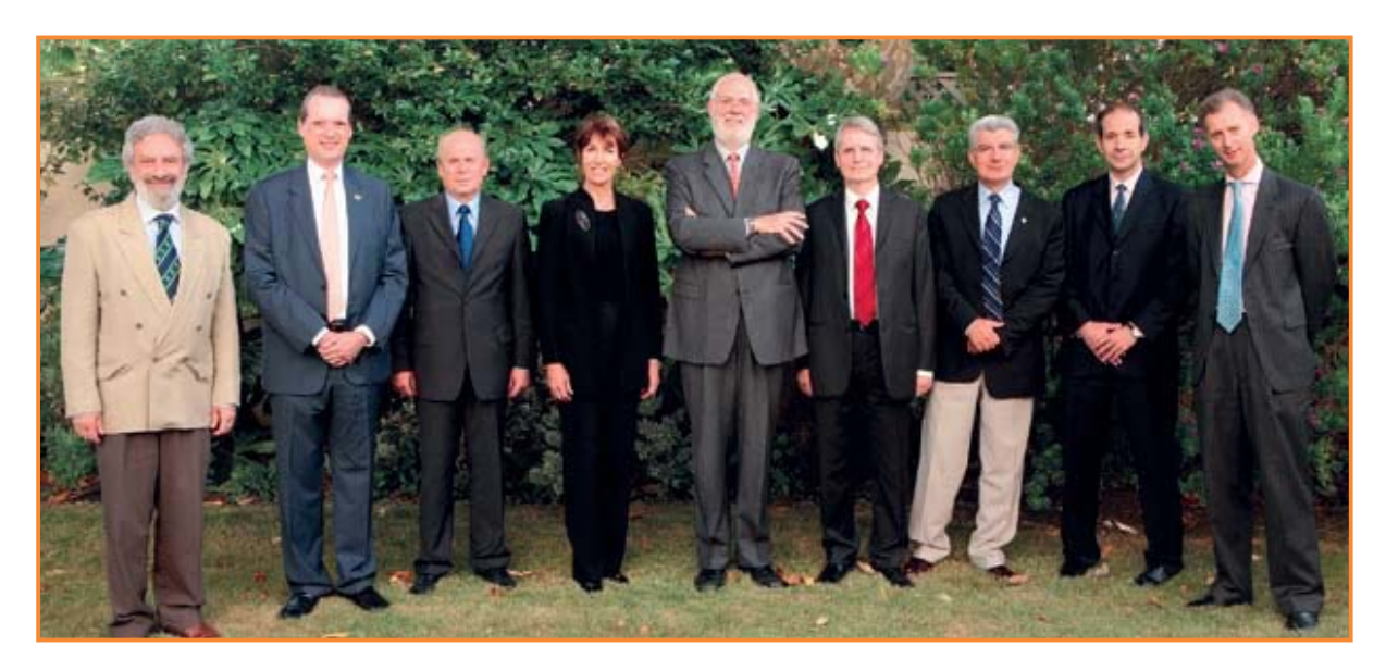
EU Member States and European Commission resident in Wellington, January 2008.

Most EU countries with accreditation to New Zealand have their Embassies located in either Wellington or Canberra. The eight EU Member States Embassies and High Commission based in Wellington represent France, Germany, Greece, Italy, Netherlands, Poland, Spain and the United Kingdom. The European Commission Delegation is also present.