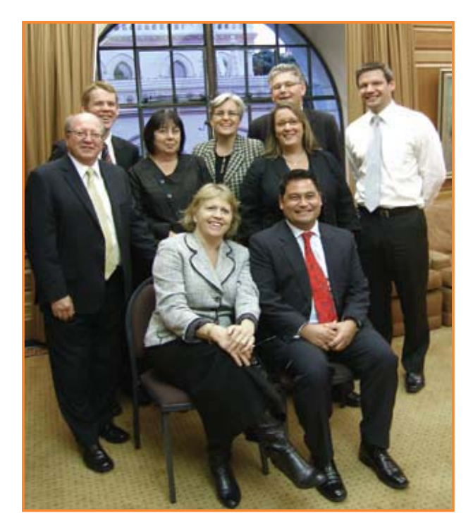
Some of the 30 members of the New Zealand-European Union Parliamentary Friendship Group.

50. Regular exchanges between the European Parliament and the New Zealand Parliament are an important dimension of the overall relationship between New Zealand and European institutions and contribute to a broader understanding of the relationship on both Participants. The New Zealand Mission to the European Union in Brussels and the European Commission Delegation Wellington will in maintain close relations with the respective Parliaments to provide information on developments in the relationship and identify opportunities to increase contact and mutual understanding.