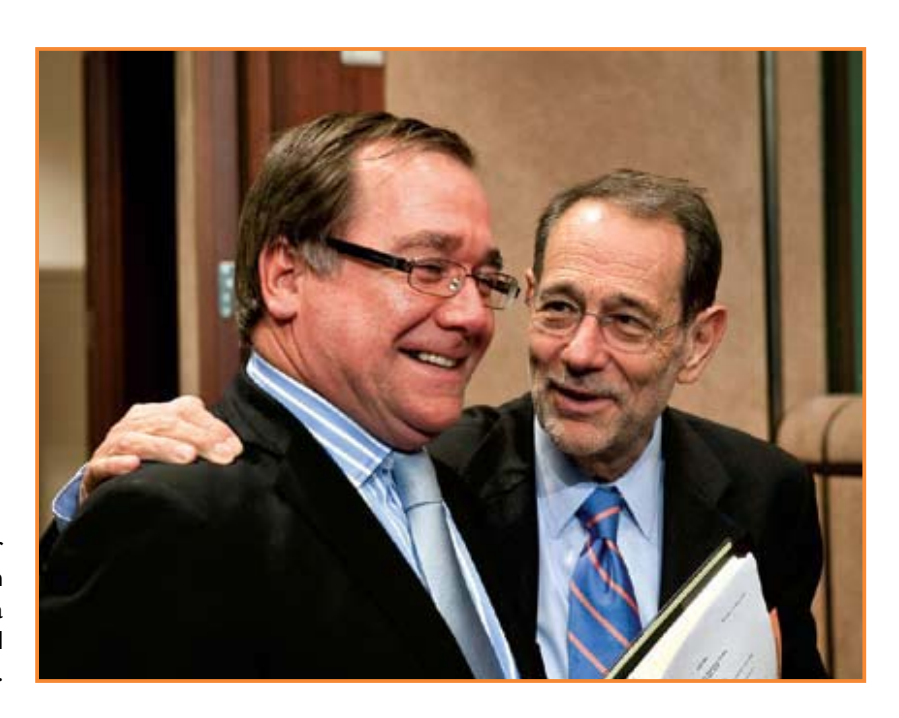
New Zealand Foreign Minister Murray McCully and EU High Representative Javier Solana at the EU-New Zealand Ministerial meeting, May 2009.