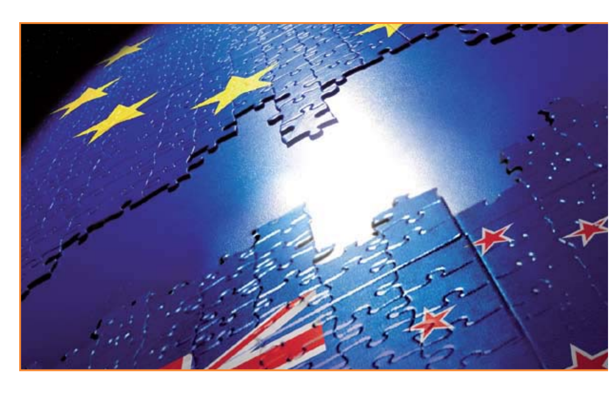
Achievements in the first two years