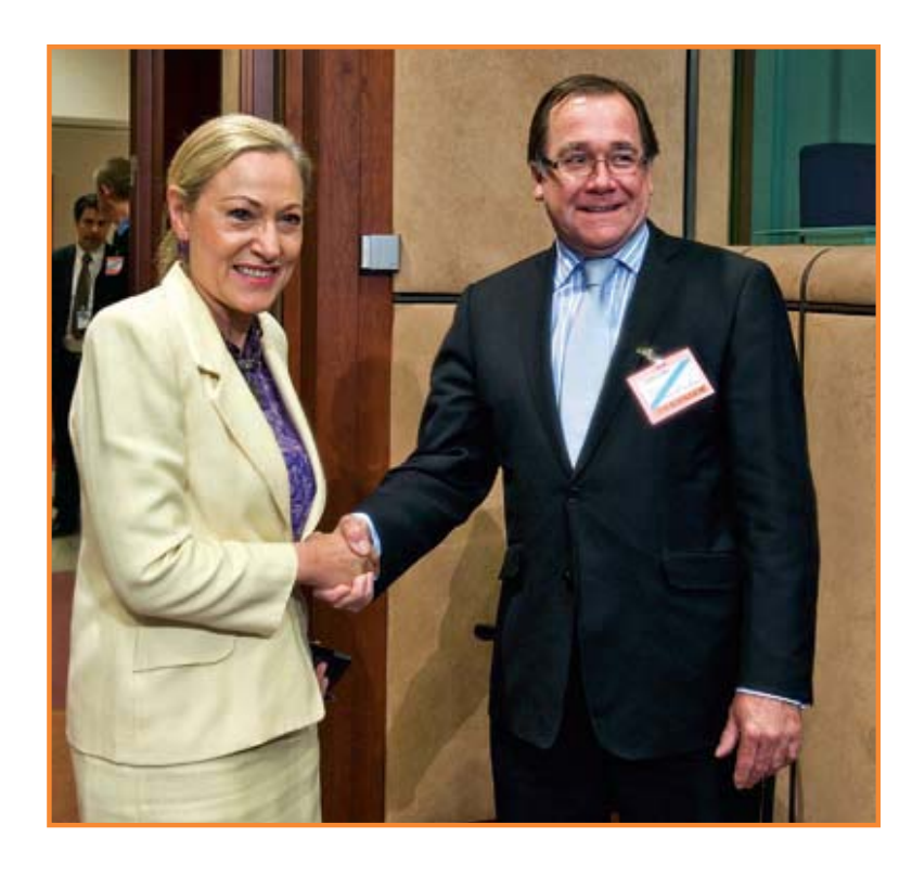
European Commissioner for External Relations Benita Ferrero-Waldner and New Zealand Foreign Minister Murray McCully at the EU-New Zealand Ministerial meeting, May 2009.

5. In today's increasingly volatile and complex international environment, the value of dialogue and the exchange of information cannot be underestimated. Both Participants welcome the existing twice-yearly bilateral Ministerial Troika consultations. Moreover, regular contacts also take place between the President of the Commission, the European Union High Representative and the New Zealand Prime Minister. The participants also note the regular dialogue between the New Zealand Parliament and the European Parliament.