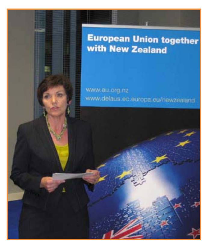
Minister of Education, Hon Anne Tolley, launching EU teaching resources for the New Zealand school curriculum, August 2009.

37. Staff and student exchanges under the auspices of the European Union Centres Network (EUCN) are an important part of the academic connections between New Zealand and Europe. Both Participants recognise and support the contribution made by the Network, with the support of the Commission, to promoting interest and expertise in the European Union within New Zealand. Both Participants will explore other opportunities to promote student and academic mobility and to deepen links between European and New Zealand counterparts.