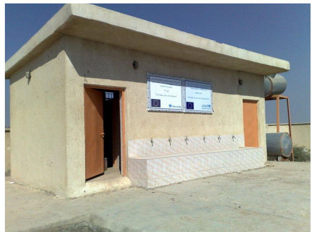
A rehabilitated latrine and hand washing facility in Al-Khahla'a school, Missan as part of an EU funded project implemented by UNICEF

Support to basic services in Iraq remains a key focus for the EU, with assistance to health, education and water & sanitation services amounting to over €83 million since 2004. Up to 2007 this support was primarily implemented through the UN arm of the IRFFI 1 . The Commission's contribution was co-mingled with other donors' funds for the implementation of projects to support the Government of Iraq in providing basic services to the population. Since 2008 the focus of EU assistance has gradually moved away from infrastructure rehabilitation to capacity and institution building to assist Iraq in mobilising its own resources to improve the welfare of the population.