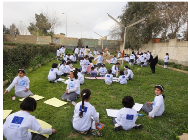
Children art competition during World Water Day Celebrations in Al Fitwa primary school for girls and boys in Mosul city, Ninewa Governorate as part of an EU funded project implemented by UNICEF

In the education sector , EU support has sought to enhance access to, and improve participation and completion at all levels of education in Iraq. Projects implemented via the IRFFI have aimed at rehabilitation of schools; developing an improved learning environment through the provision of teaching and learning materials; enhancing policy formulation and curriculum development; and, improving health and nutrition of students.