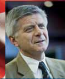
Marek Belka, former Prime Minister of Poland