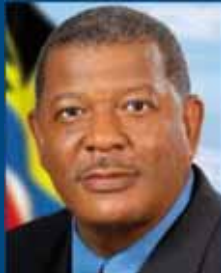
Baldwin Spencer, Prime Minister of Antigua and Barbuda