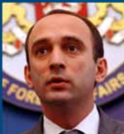
Grigol Mgaloblishvili, former Prime Minister of Georgia