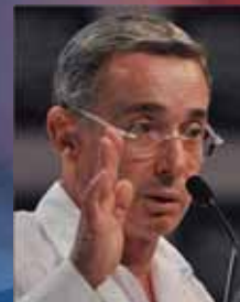
Alvaro Uribe Velez, former President of Colombia