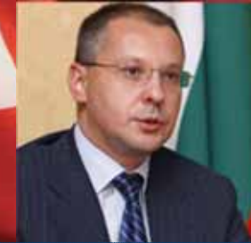
Sergei Stanishev, former Prime Minister of Bulgaria