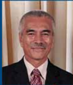
Anote Tong, President of Kiribati