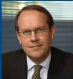
Jorma Ollila, Non Executive Chairman, Royal Dutch Shell; Chairman, NOKIA