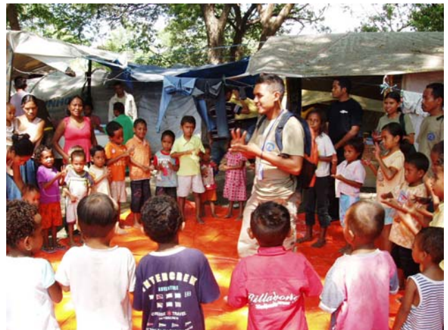
One of several child-friendly spaces set up by Plan International in camp in Dili to monitor Children's well-being.