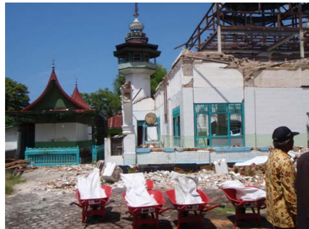
Construction tool kits being distributed in West Sumatra.