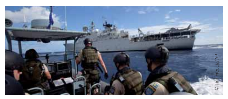
The EU runs civil or military peacekeeping operations such as this anti-piracy force off the coast of Somalia.

Since 2003, the European Union has launched 22 military operations and civilian missions. The first of these was in Bosnia and Herzegovina, where EU troops replaced NATO forces. These missions and operations, under the European flag, are being or have been deployed on three continents. They include the EUFOR mission in Chad and the Central African Republic, Eunavfor's 'Atalanta' operation to combat Somali piracy in the Gulf of Aden, the EULEX mission to help Kosovo firmly establish the rule of law, and the EUPOL mission in Afghanistan to help train the Afghan police.