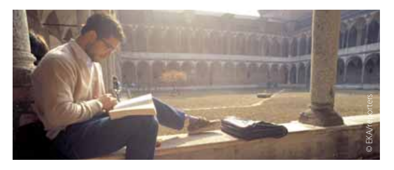
One of the objectives of 'Europe 2020' is bringing higher education and the business world closer together.