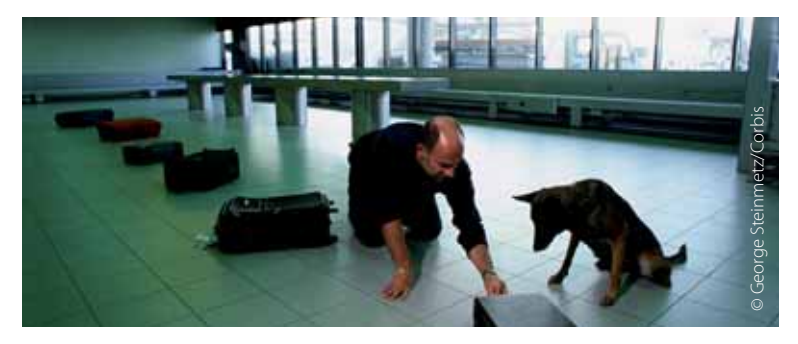
Cooperation between European customs authorities is helping to reduce trafficking and crime.