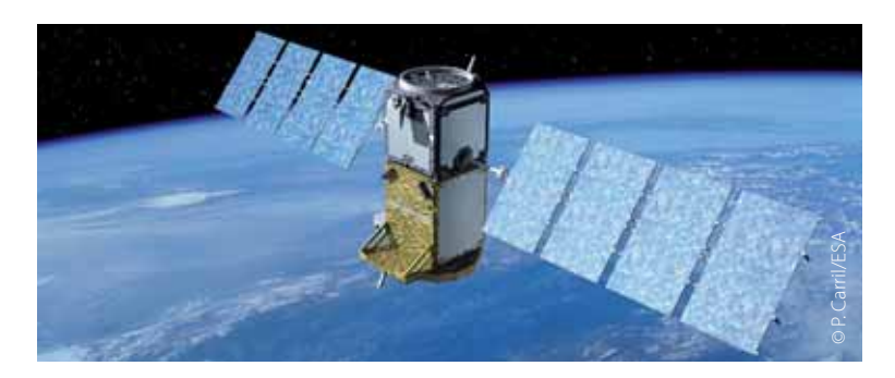
The EU encourages innovation and research such as 'Galileo', Europe's own global navigation satellite system.

Joint research at EU level is designed to complement national research programmes. It focuses on projects that bring together a number of laboratories in several EU countries. It also supports fundamental research in fields such as controlled thermonuclear fusion — a potentially inexhaustible source of energy for the 21st century. Moreover, it encourages research and technological development in key industries such as electronics and computers, which face stiff competition from outside Europe.