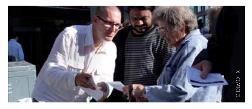
A more democratic Europe: thanks to the Lisbon Treaty, European citizens can now propose new laws.