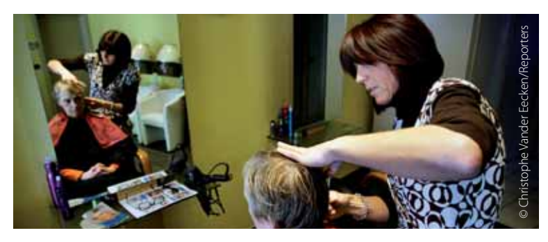
Europeans are free to live and work in any EU country that they choose.

Before travelling within the EU you can obtain from your national authorities a European health insurance card, to help cover your medical costs if you fall ill while in another country.