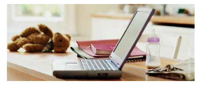
One of the basic rights laid down in the Charter of Fundamental Rights of the European Union is that of balancing family life with a career.

Moreover, Article 6 of the Treaty of Lisbon provides a legal basis for the EU to sign up to the European Convention on Human Rights. This Convention would then no longer be merely referred to in the EU Treaties but would have legal force in EU countries, thus giving greater protection to human rights in the European Union.