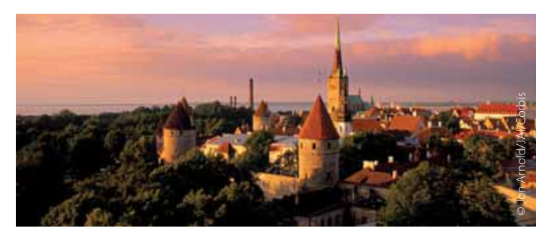
Tallin, the capital of Estonia, where the euro replaced the 'kroon' in January 2011.

The Treaty of Lisbon gave the Eurogroup formal status. In January 2010 the Prime Minister of Luxembourg, Jean-Claude Juncker, was re-elected President of the Eurogroup for a period of two and a half years.