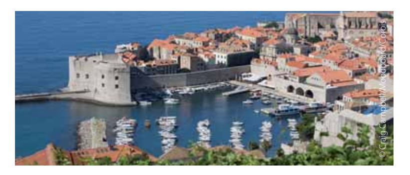
The 'Pearl of the Adriatic' — Dubrovnik in Croatia, a candidate for EU membership.