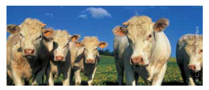
Agriculture must provide safe food of good quality.

However, the CAP became a victim of its own success. Production grew far faster than consumption, placing a heavy burden on the EU budget. In order to resolve this problem, agricultural policy had to be redefined. This reform is beginning to show results: production has been curbed.