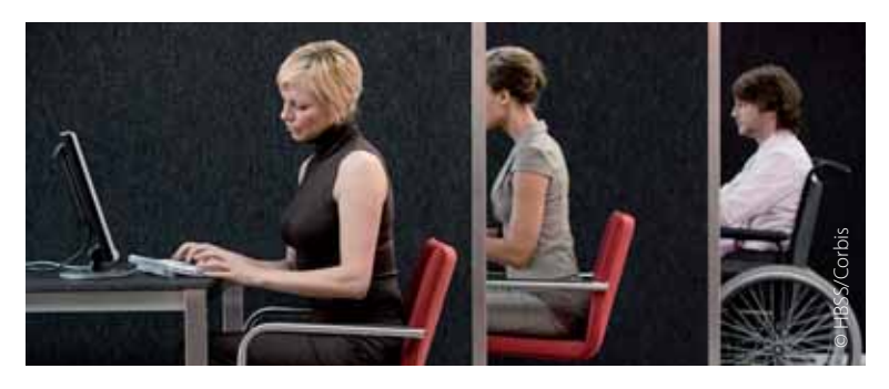
The Court of Justice ensures that European law is fully respected. It has, for example, confirmed that discrimination of handicapped workers is forbidden.