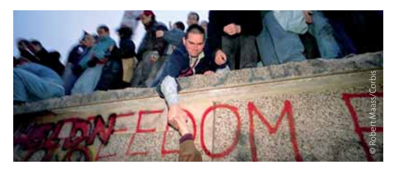
The fall of the Berlin Wall in 1989 led to a gradual breaking down of old divisions across the continent of Europe.