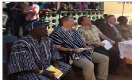
The Ambassador and his team at a durbar hosted in his honour