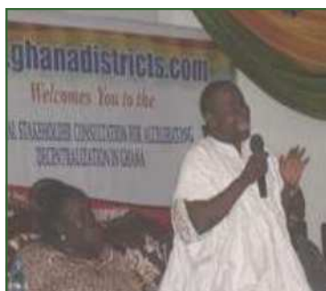
Officials addressing a seminar on decentralisation

Since then Ghana has been operating a hybrid system of managing local governments: whilst there is a relatively extensive allocation of financial and human resources (strong de-concentration) to the districts, the Government has until recently continued to maintain a direct control from the centre over utilisation and management of those resources.