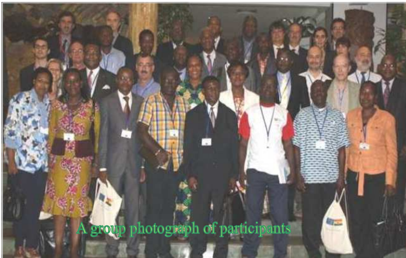
A group photograph of participants

The "Banana Package" initialled in December 2009 and adopted in March 2010 includes a) the EU's Geneva Agreement on Trade in Bananas (GATB) with Latin American Most Favoured Nations suppliers, b) the agreement with the United States, and c) the Commission's commitment to African, Caribbean and Pacific (ACP) banana-exporting countries to provide development assistance to support their adjustment to the new market conditions.