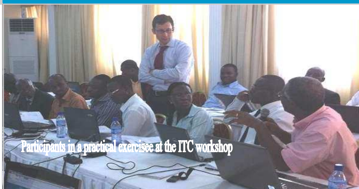
Participants in a practical exercise at the ITC workshop

A day's workshop on "Market Analysis and Private Standards in the Ghanaian Commodities Sector" was held in Accra on March 13, 2012. It was jointly hosted by the International Trade Centre (ITC) and the Delegation of the European Union to Ghana with the kind support of the Ghana National Chamber of Commerce and Industry.