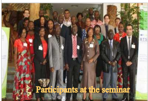
Participants at the seminar

The training was expected to increase participants' knowledge of EU rules and requirements as regards official control procedures for food of animal origin imported into the EU market and allow them to use TRACES, a web-application delivering export certificates on-line.