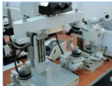
An equipment at the laboratory