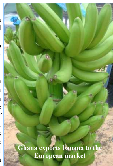
Ghana exports banana to the European market

This was an interim measure in advance application of the EPA agreements (awaiting the signature and ratification processes).