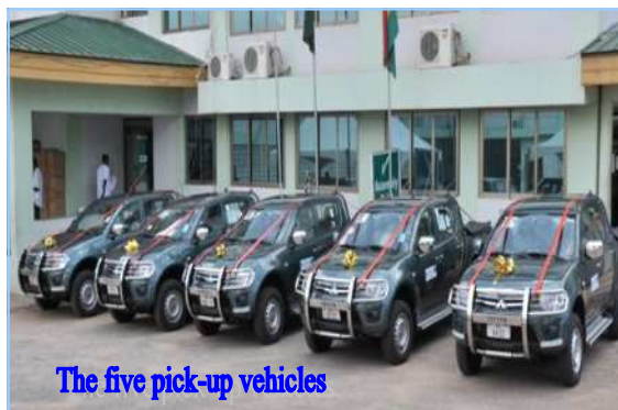
The five pick-up vehicles