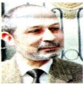
== ممدوح قطب