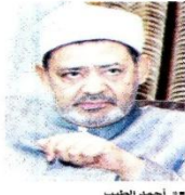
== أحمد الطيب

«الطيب» لممدوح قطب: نقف على مسافة واحدة من جميع المرشحين كتب - لؤي علي