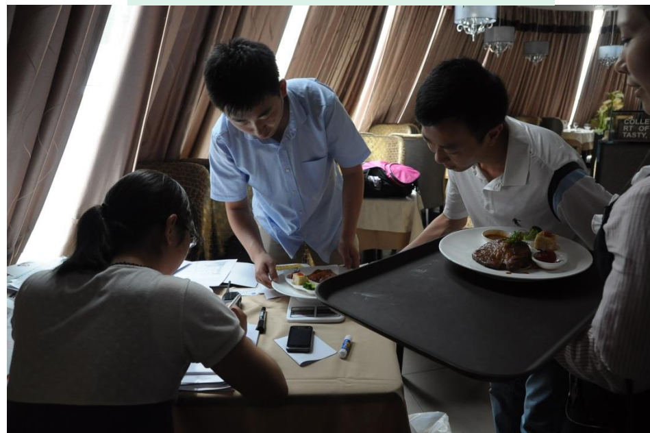
Weighing a plate of beef