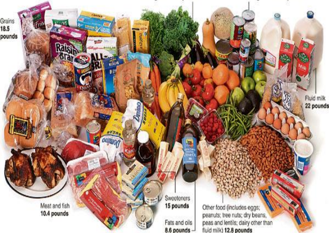
Grains 18.5 pounds