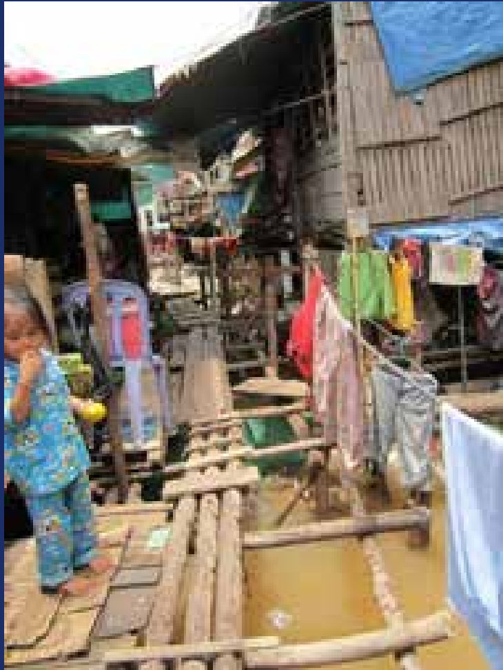
Bottom of the gradient