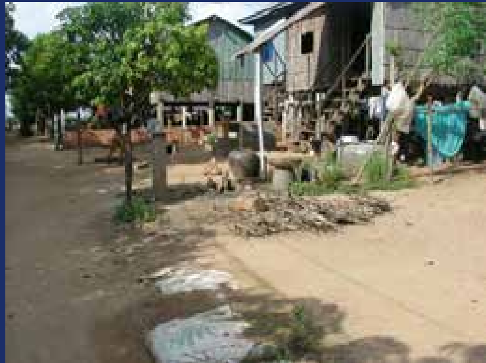
Top of the gradient