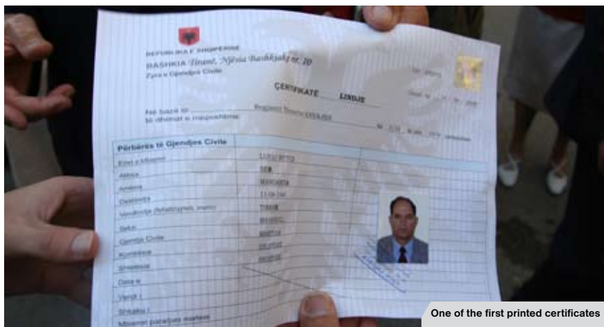
One of the first printed certificates

"These are the first tangible results of the modernization of the civil registration system," said Ambassador Bosch. "In order to ensure sustainable results, it is important to provide continuous commitment to the process at all levels. The Interior Ministry and the Civil Status Offices are aware of the major challenge ahead in maintaining the quality and sustainability of the new system", he added.