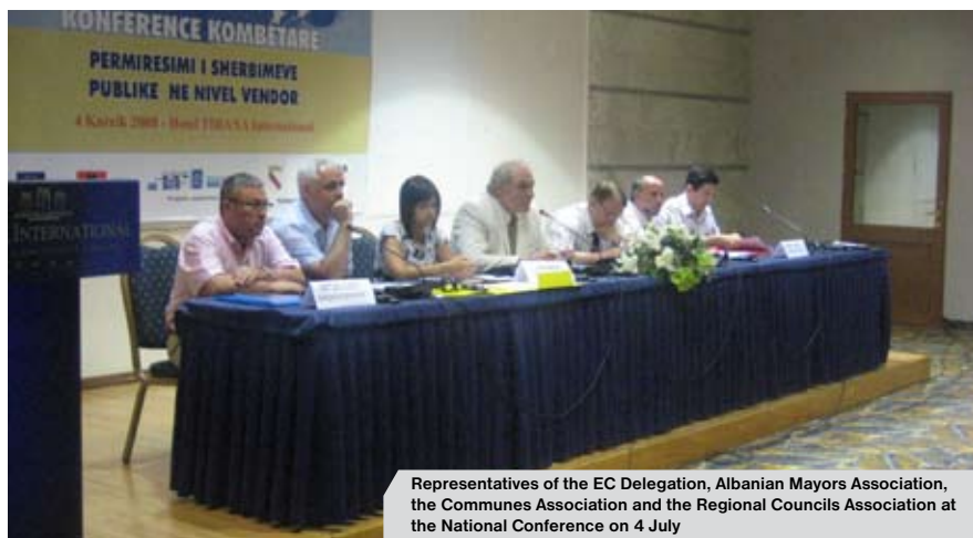
Representatives of the EC Delegation, Albanian Mayors Association, the Communes Association and the Regional Councils Association at the National Conference on 4 July

The European Union supports Albania's Local Government Units in strengthening the local licensing administration capacities which promotes transparency in private-public partnership and better services for the local community. Funded by the EU, the € 1 million