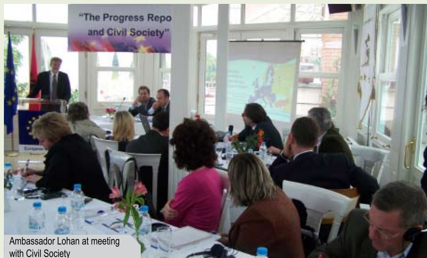
Ambassador Lohan at meeting with Civil Society

ssues discussed regarded : Fight against corruption and the upcoming elections, legal framework for civil society organisations, protection and promotion of human rights, and social inclusion and fight against discrimination, as areas where civil society activity and expertise is essential.